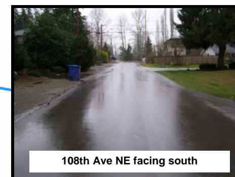
108th Ave NE facing south

Radar Dolly —We have a portable radar sign on a dolly residents can borrow and place on their street for up to two weeks. This unit gives motorists feedback on the speed at which they are driving, encouraging them to obey the speed limit.