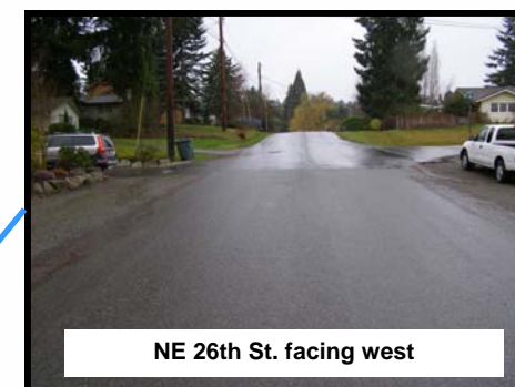
NE 26th St. facing west