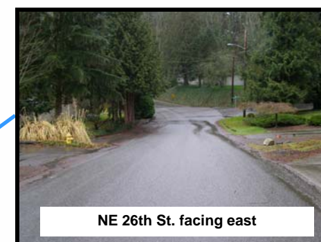
NE 26th St. facing east