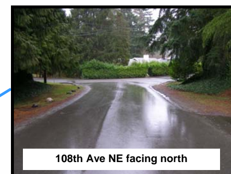
108th Ave NE facing north