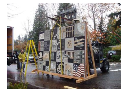
Tile Mural By Sepp Mayrhuber Bellevue Public Library-©1967 Re-Installed 2005 Northwest Arts Center

Depicting the development of culture as seen in great human epochs and individual achievements.