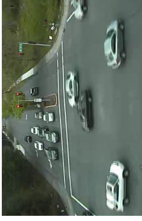
Traffic signal to be replaced at 148th Ave NE and NE 8th St