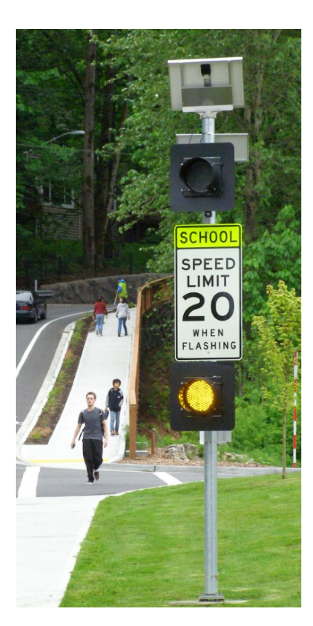
Example of a school zone flashing beacon

Concept design boards can be found at <u>www.bellevuewa.gov/eastgatetyeetraffic</u>.