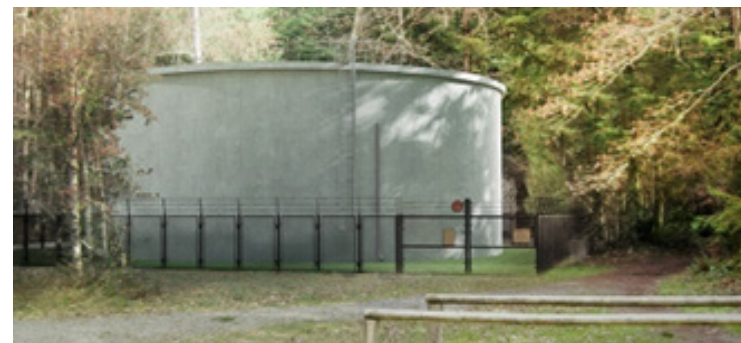
Proposed Pikes Peak Reservoir