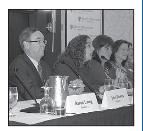
City Council Election Page 3