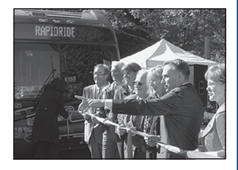
Faster buses. Page 5