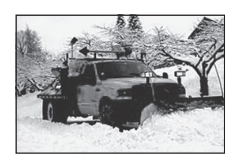
La Niña on the way. Page 7