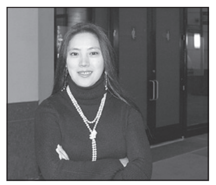
Trade with Asia emphasized. Page 4