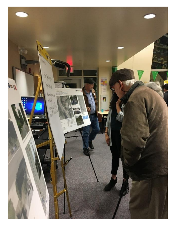
Attendees were able to provide comments by talking to staff directly or by filling out comment cards