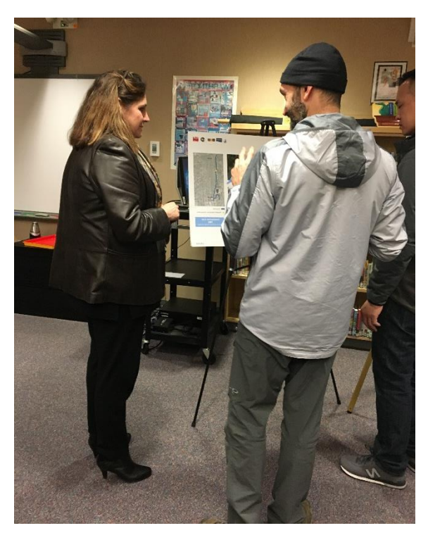
Community priorities were identified by discussing concepts with meeting attendees