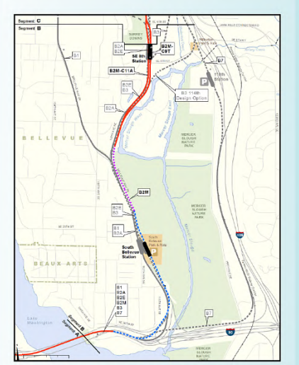
Final EIS Alternatives