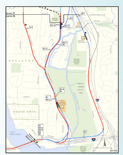
Segment B Alternatives Evaluated in Draft EIS