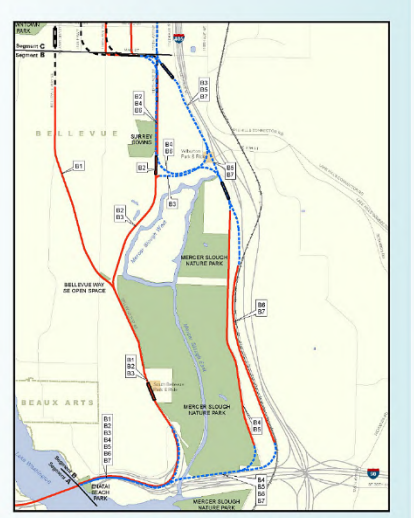
Segment B Alternatives for Public Scoping