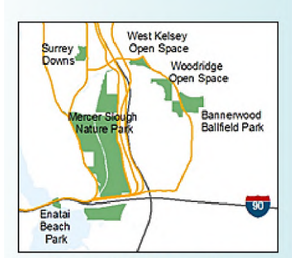
Segment B Alternatives Developed (1970 – 2006)