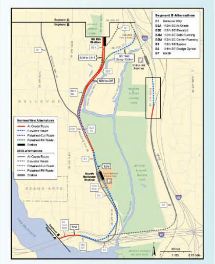
New Alternative B2M Evaluated in SDEIS