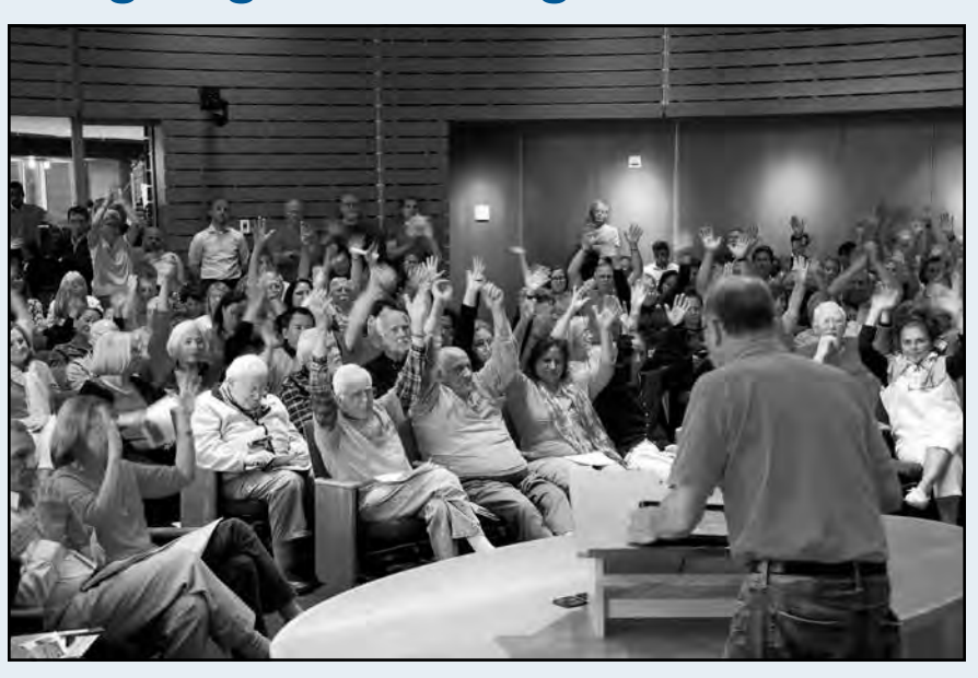
Audience members wave in support of a speaker at a community forum concerning Puget Sound Energy's Energize Eastside project. Nearly 300 people showed up to the June 3 forum hosted by the city. Details about the city's electrical facilities planning at <a href="www.bellevuewa.gov/electrical-facilities.htm">www.bellevuewa.gov/electrical-facilities.htm</a>.