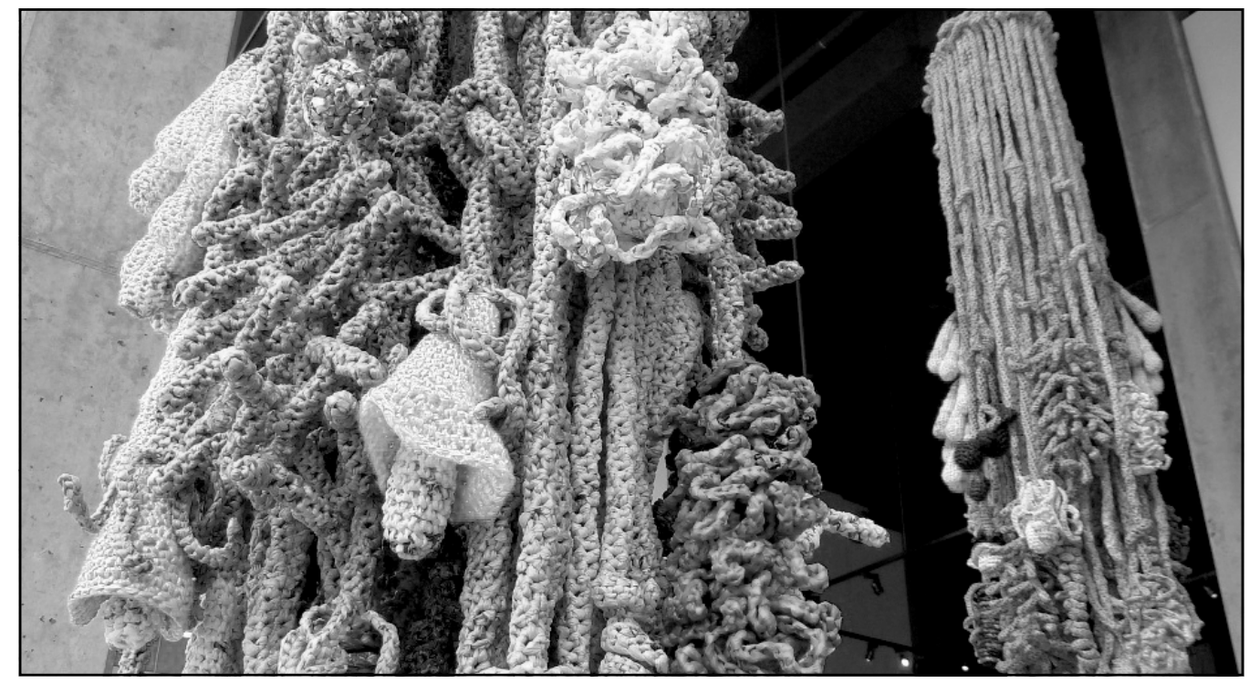
In Barbara De Pirro's "Flora Floresta," 2,000 plastic bags were cut into strips and crocheted into plant forms.

"Bellwether," Bellevue's much celebrated biennial sculpture exhibition, opens June 27 with a theme focused on our connections with communities, nature and each other.