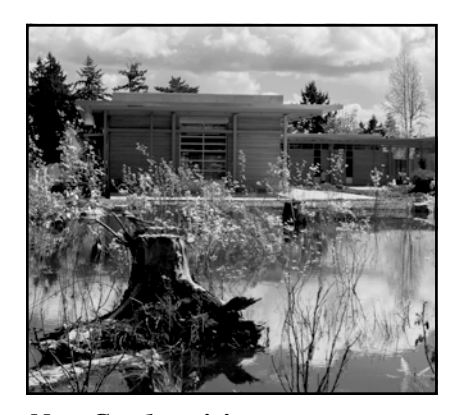
New Garden visitor center Page 5