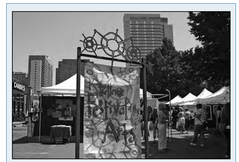
Enjoy the variety of three art fairs this coming July 25-27 in downtown Bellevue.

The Bellevue Youth Theatre presents this fun story featuring the unconventional character from children's literature. Suitable for all ages. $5/person; festival seating. byt@bellevuewa.gov or 425-452-7155