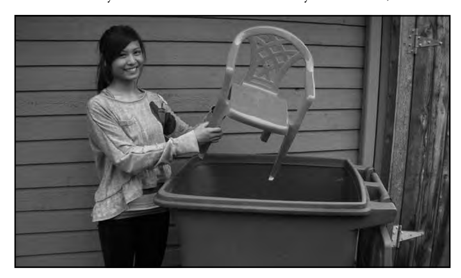
Plastic chairs in the recycling cart? Yes, after June 29 residents will be able to recycle rigid plastics such as lawn chairs,

Multifamily customers will now be able to recycle new items, such as