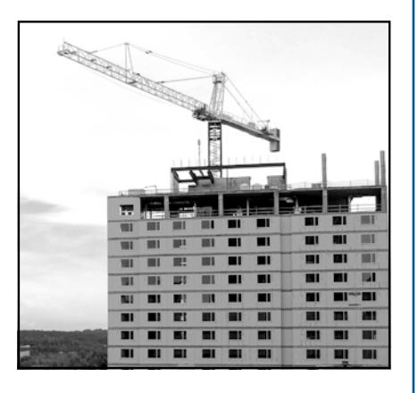
Growing pains worth it Page 3