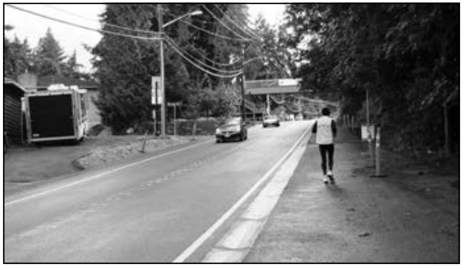
A jogger uses the new multi-use path.

Without the southbound detour, frequently changing lane closures and confusing detours would have created even greater traffic impacts and widely varying commute times,