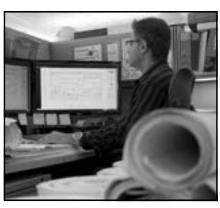
Paperless permits experts Page 4