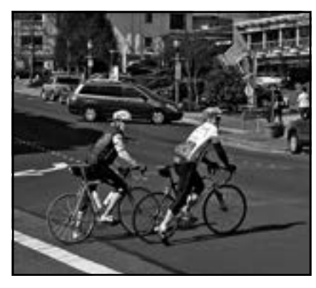
Best ideas help city plan Pages 6