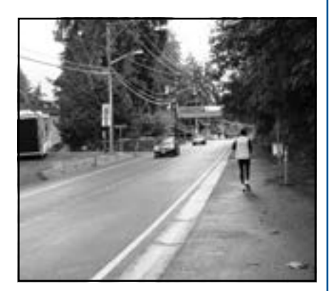
West Lake Sammamish reopens Page 5