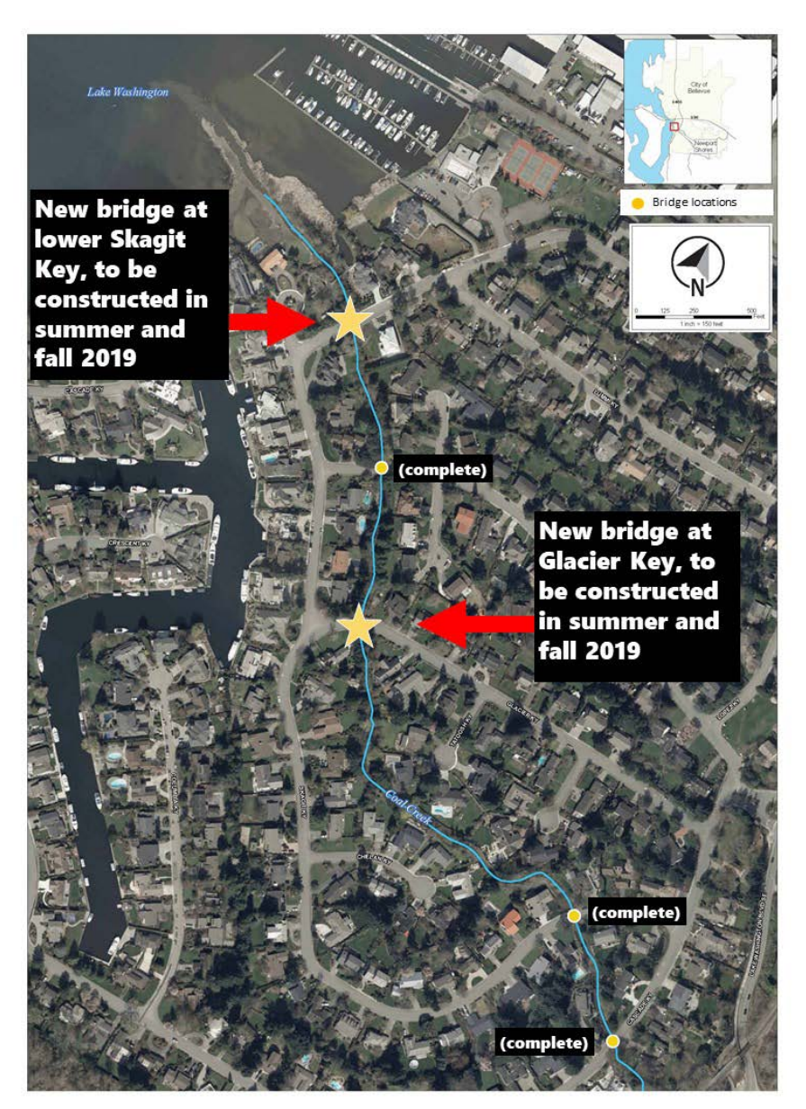
Bridges scheduled for construction in 2019

The City of Bellevue (Bellevue) is seeking to reduce the risk of flooding in the Newport Shores neighborhood. To reduce the possibility of flooding from Lower Coal Creek, Bellevue will construct new bridges (culverts) at five creek crossings in the neighborhood. These bridges will better allow the passage of creek water, reduce the chance of debris blockages, and eliminate the partial fish passage barrier that currently exists at Cascade Key.