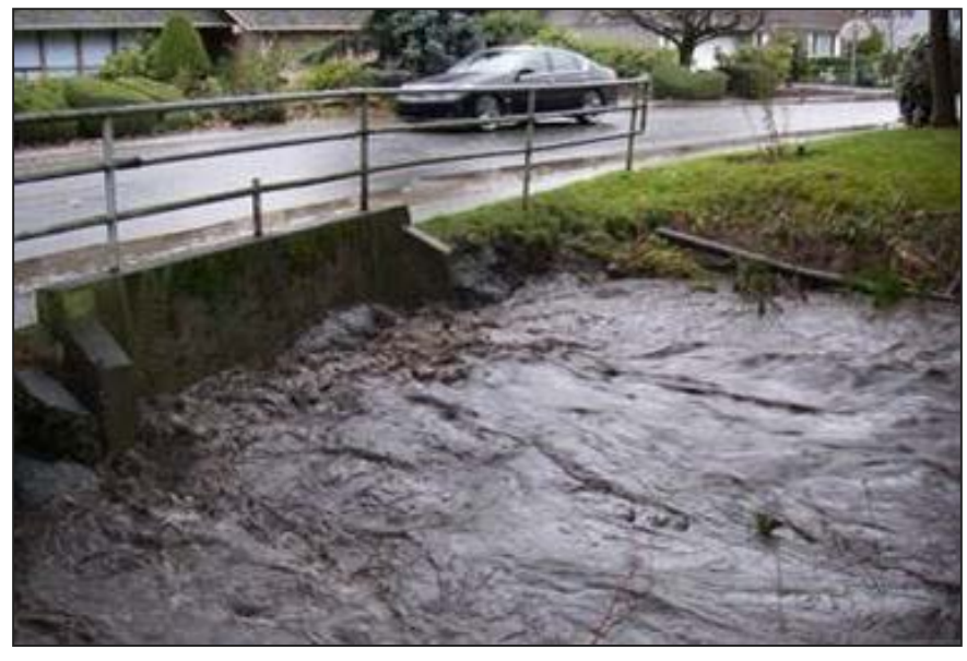
Flooding at Glacier Key

Both bridges will have wider sidewalks to meet current sidewalk standards. The bridges will have slotted rails to allow views of the creek, but will also meet standards for bridges.