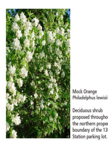
proposed throughout the northern property boundary of the 130th

Deciduous shrub proposed for natural drainage areas throughout the parking