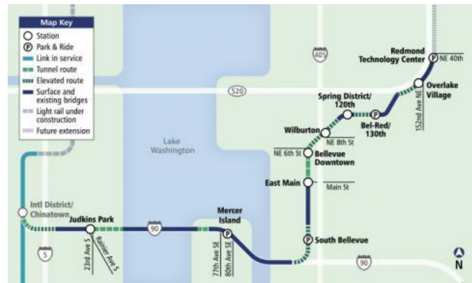
East Link Extension map www.soundtransit.org/eastlink

The new maintenance facility will support the efficient light rail operations approved and funded by regional voters in 2008. The OMF East will be used to store (overnight), maintain, and dispatch 96 Light Rail Vehicles (LRVs) for daily service by providing vehicle storage, preventative maintenance inspections, light maintenance, emergency maintenance, interior vehicle cleaning, and exterior vehicle washing. This facility will operate 24 hours a day, 7-days a week, 365 days a year and accommodate supportive administrative functions for approximately 250 full time employees.