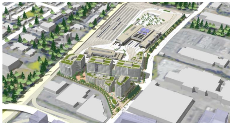
Schematic of OMF East (aerial view, looking north west)