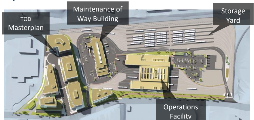
Schematic of the OMF East property, including concepts for Transit Oriented Development (TOD)

In June 2017, Sound Transit selected the design-build team of Hensel Phelps to design and construct the OMF East facility and prepare design concepts for the future transit oriented development (TOD) to be created from surplus property once the OMF East is constructed. The project requires review and approval through City permit processes, including a Master Development Plan (MDP) for the TOD concepts and formal Design Review (DR) for the OMF East facility.