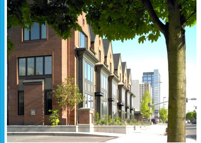
Townhomes at 1200 Bellevue Way