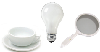
Mirrors, window glass, ceramic dishes, incandescent & halogen bulbs (No fluorescent tubes/bulbs)