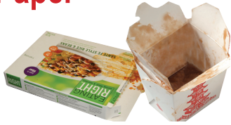
Plastic coated, food-soiled paper