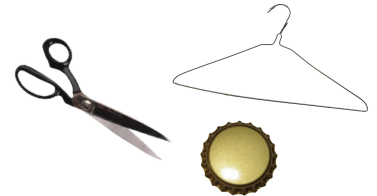
Metal lids & caps (Less than 3 in. wide) & sharp metal items