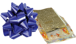
Bows, shiny paper, & bubble-wrap envelopes