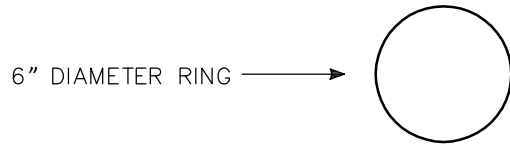
STAMPED RING TEMPLATE C