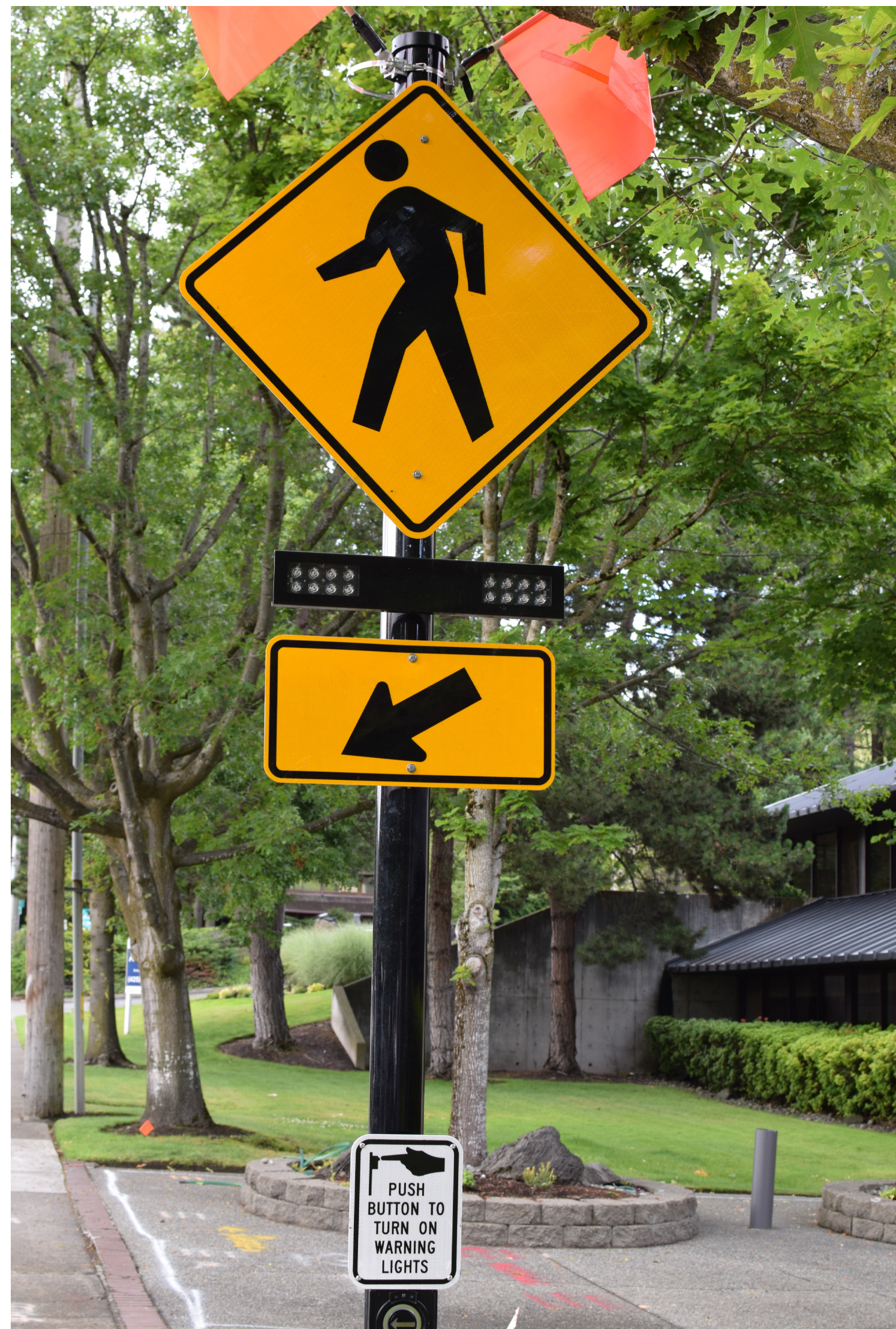
Example of a flashing pedestrian beacon