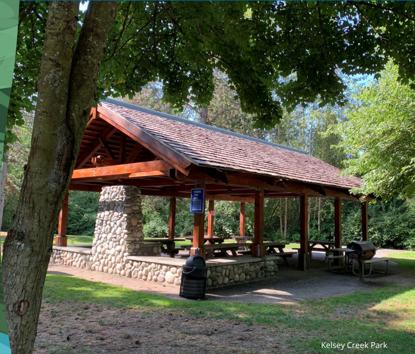
Kelsey Creek Park

Check availability and request online at: register.bellevuewa.gov