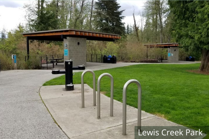
Lewis Creek Park