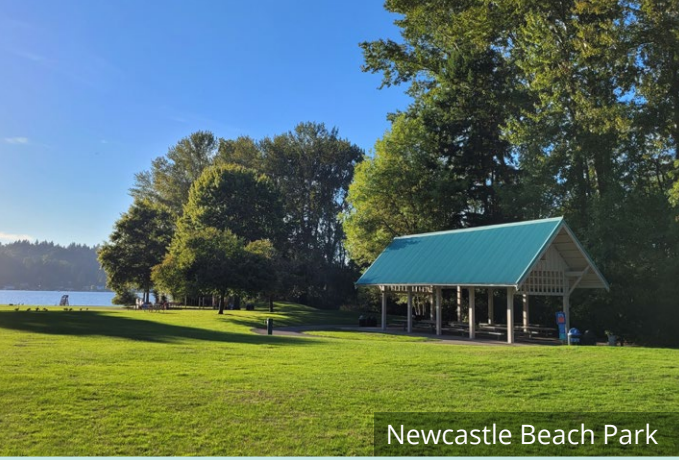
Newcastle Beach Park