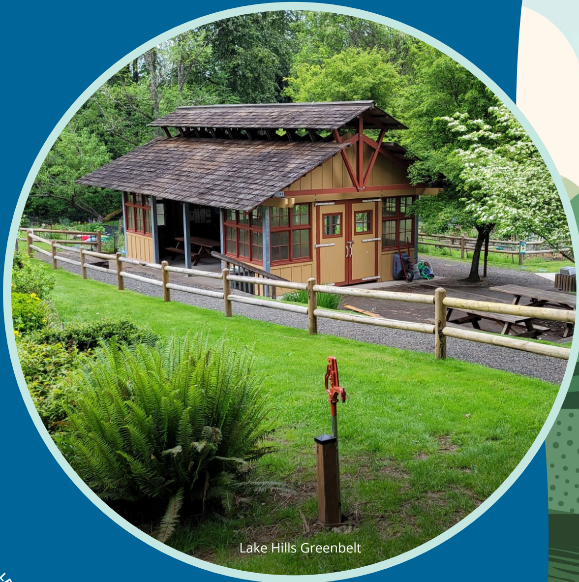
Lake Hills Greenbelt

Information contained in this guide is subject to change.