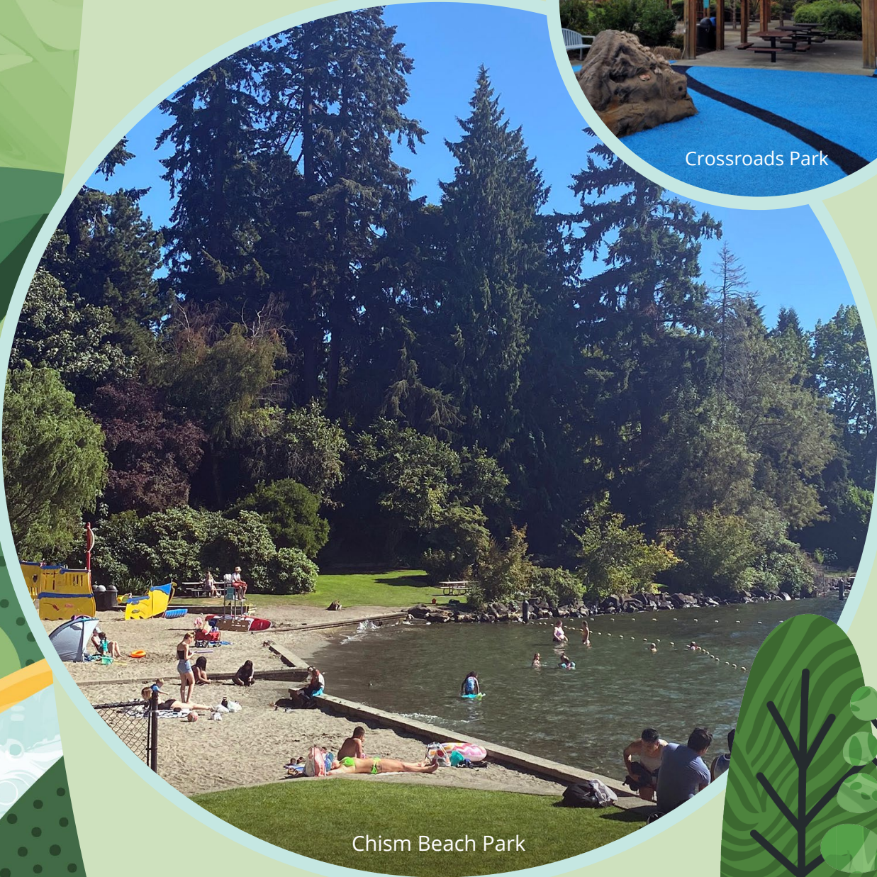
Chism Beach Park