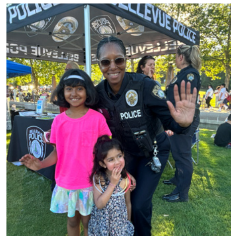
Bellevue Family 4th