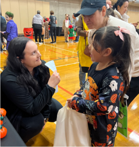
Halloween on the Hill