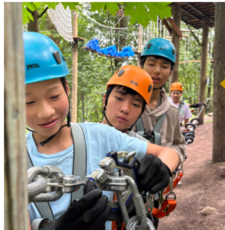
Summer Youth Camp