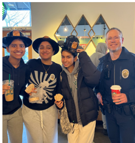
Coffee with a Cop