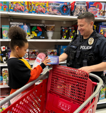
Heroes and Helpers