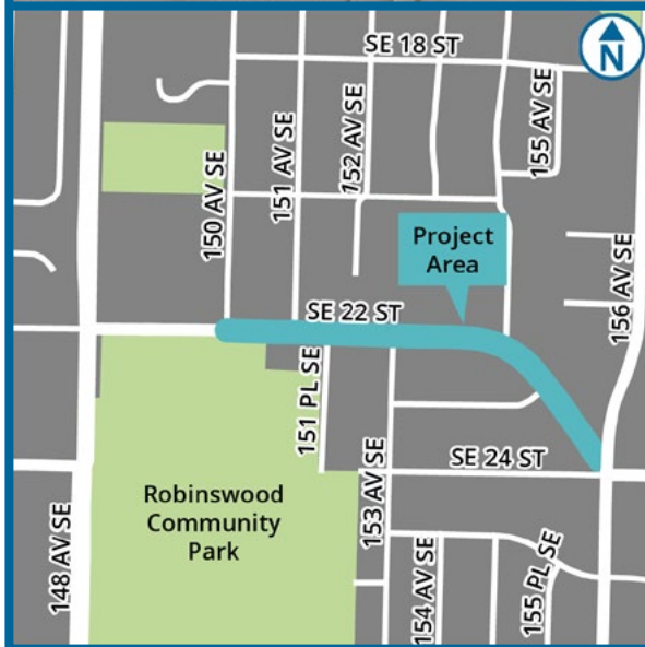
SE 22nd Street Speed Cushion Map