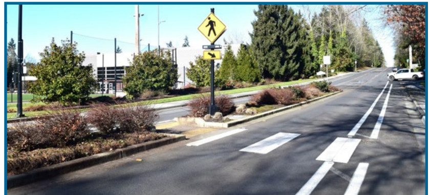
sample pedestrian flashing beacon + median