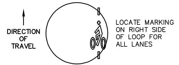
ROUND LOOP (ALWAYS RIGHT SIDE)