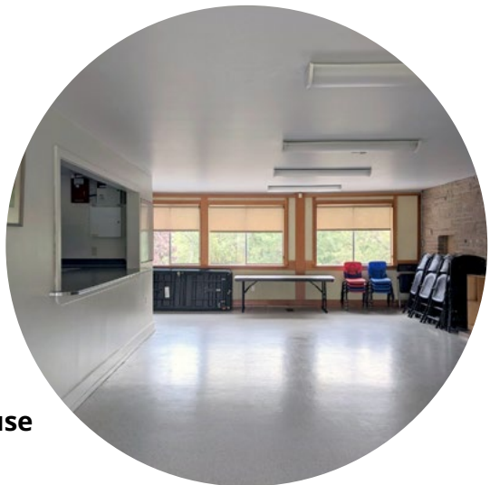
Kelsey Creek Farm House