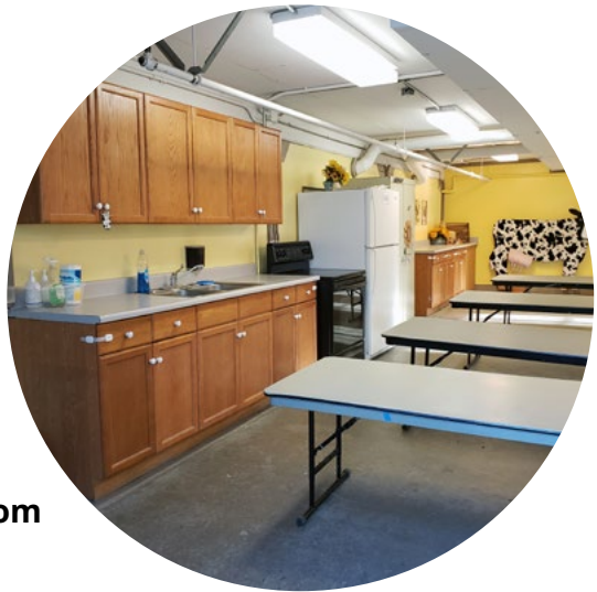
Kelsey Creek Farm Room (Education Barn)

Both rental spaces can be reserved seven days a week, and these spaces easily accommodate groups large or small with rooms for groups up to 30 people. To reserve, send an email with requested dates and times to kelseycreekfarm@bellevuewa.gov .