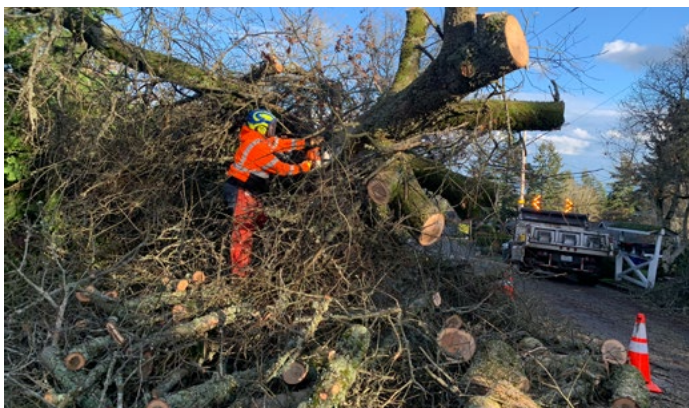
Transportation Department Vegetation Lead Travis Bliven cuts up trees in the street for removal after November's windstorm.

The EngagingBellevue online open house will be available later this month. Visit BellevueWA.gov/hmp for the details, as well as more information on the plan.