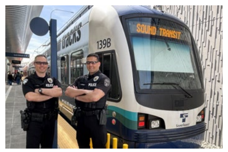
The Blue Light Rail Unit (BLU) oversees Sound Transit's 2 Line within Bellevue city limits. Officers within the unit oversee and enforce city laws for riders utilizing the region's light rail system along the Eastside.