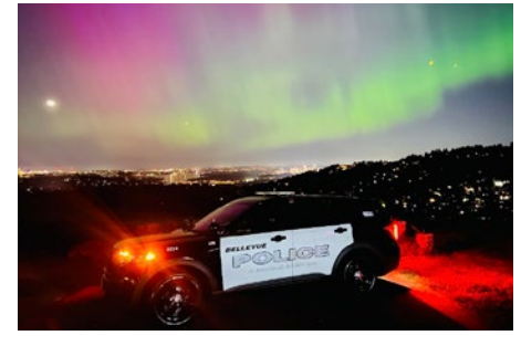
The Patrol Squads provide 24/7 police services to all those who live, work and visit in Bellevue. Our patrol officers are responsible for response to all 911 emergency calls, routine calls for service, and proactive policing.