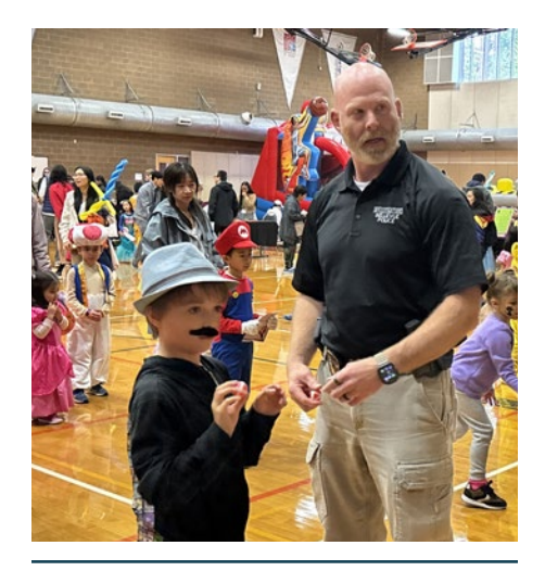
Halloween on the Hill