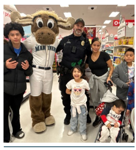
Shop with a Cop