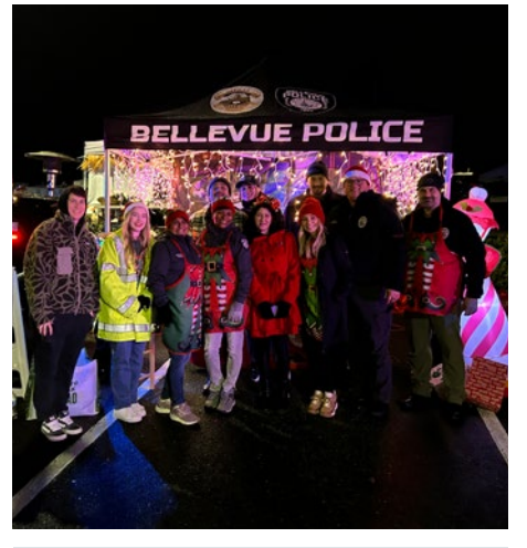
Battle of the Badges