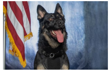
The K-9 Unit is responsible for visible patrol, response to in-progress calls, tracking fleeing suspects, searches, evidence location, and narcotics detection. The unit consists of a supervisor, three K-9 Officers, and three police dogs.