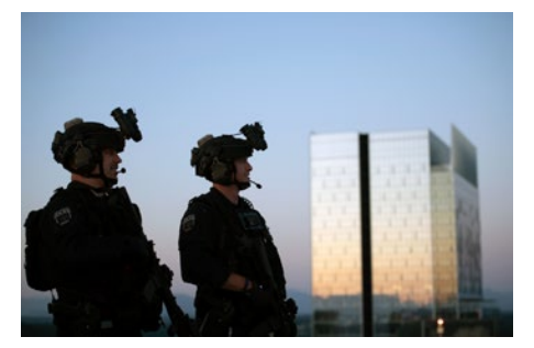
The Special Weapons and Tactics ( SWAT ) Team provides specialized support for high-risk incidents and search warrants, and team members assist with security at community events throughout the year.