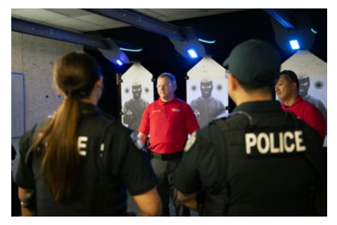
The Personnel Services Unit (PSU) is responsible for recruiting, hiring and training new employees of the Bellevue Police Department, as well as administering ongoing training.