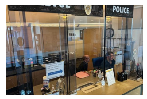
The Administrative Services section includes records supervisors, support specialists, police records disclosure specialists, and our property and evidence technicians.