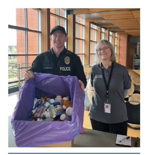
Drug Take Back