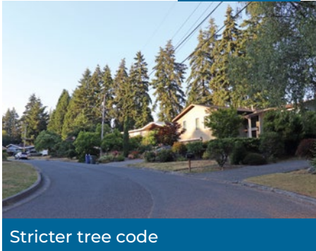
Stricter tree code