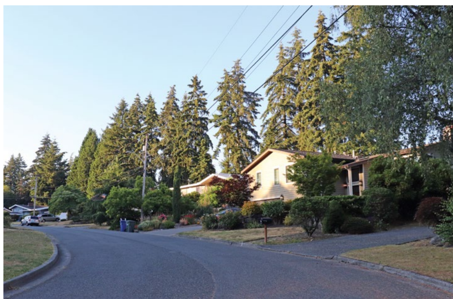
Stately trees are a glorious feature of Bellevue.