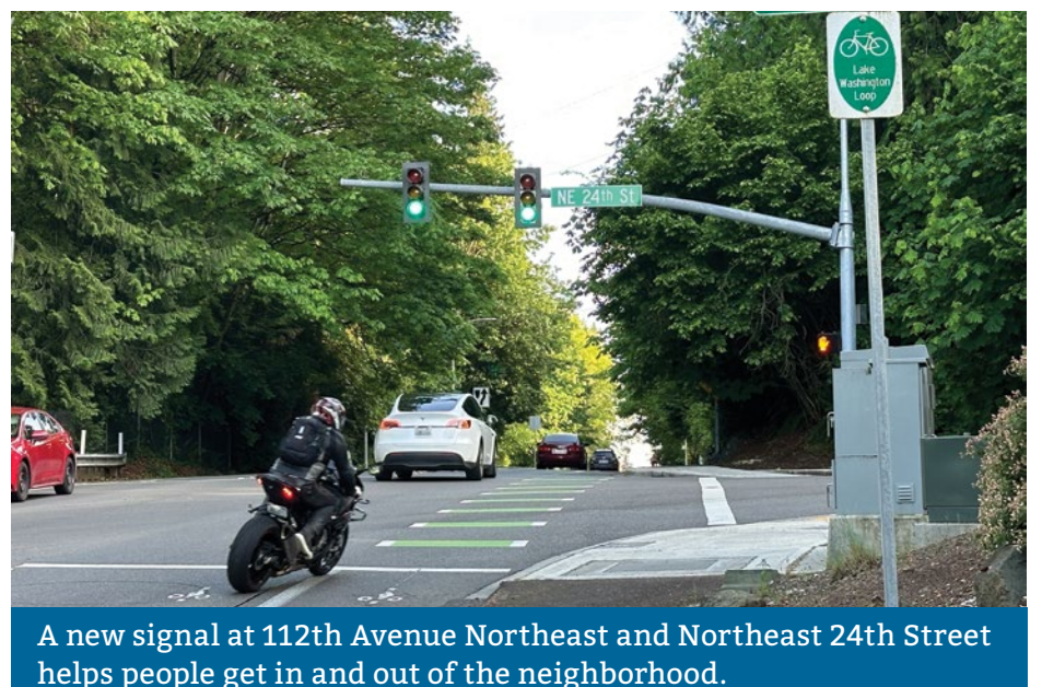
A new signal at 112th Avenue Northeast and Northeast 24th Street helps people get in and out of the neighborhood.