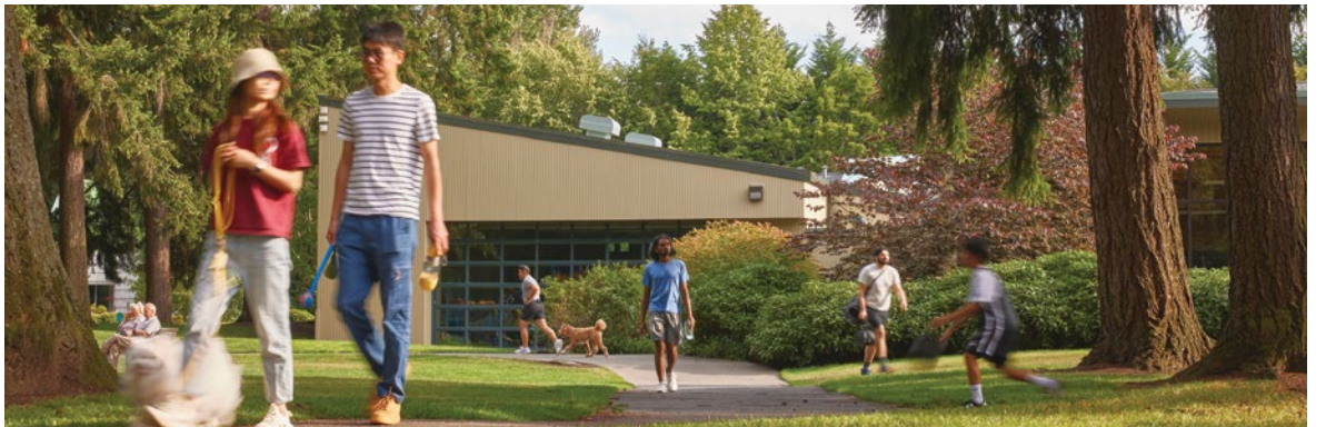
People stroll around the Crossroads Community Center.