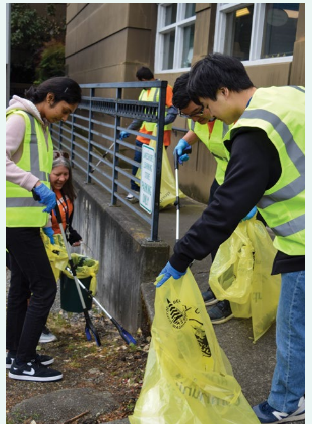
Volunteers with Amazon participate in a cleanup.

Let's keep Bellevue beautiful – one street at a time! Learn more at BellevueWA.gov/keepbellevuebeautiful .