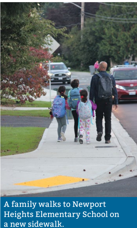
A family walks to Newport Heights Elementary School on a new sidewalk.

The 20-year Transportation-focused levy approved by voters in 2016 produces revenue at a rate of 15 cents per $1,000 of assessed property value, allowing the city to tackle projects long desired by the community across six categories: transportation safety, bicycle facilities, sidewalks, maintenance, transportation technology and congestion reduction. In 2024, that translated to $9.19 million in revenue.