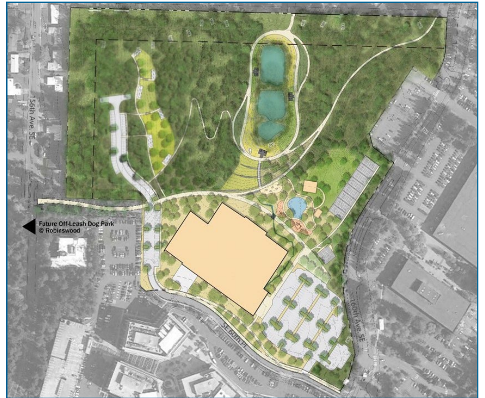
The updated master plan for Bellevue Airfield Park features an aquatic center and pickleball courts on the eastern edge of the park, along with habitat conservation.

Staff will initiate procurement for park design and engineering work to support the permitting and first phase of construction. More information is available at BellevueWA.gov/airfield-park .