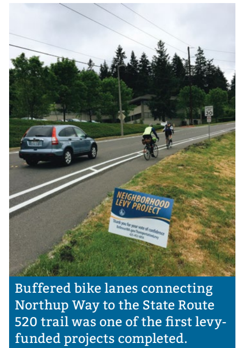
Buffered bike lanes connecting Northrup Way to the State Route 520 trail was one of the first levy-funded projects completed.

These small but mighty projects are changing the transportation network and strengthening the neighborhoods that make Bellevue a great place to live, work, study and play.