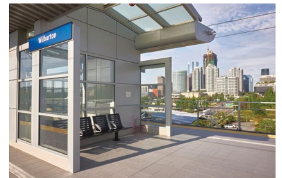
The 2 Line passing through Wilburton is among the advantages of the neighborhood for sustainable practices.

A sustainable district can take many forms. As an arts district embeds art into every aspect of a place, a sustainable district is a geographic area where sustainable practices are integrated throughout – in buildings, open spaces and the public's interactions with the space.