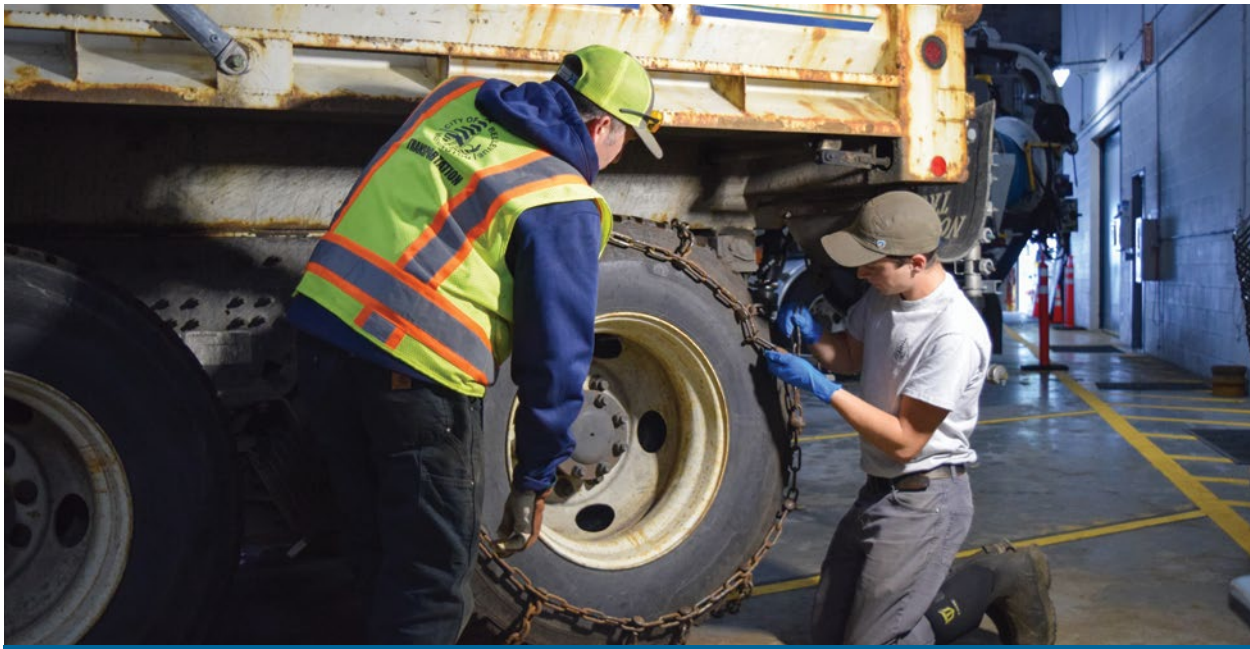
Chained melody? As part of training for winter weather, city staff practice mounting chains on the tires of trucks used for plowing snow.