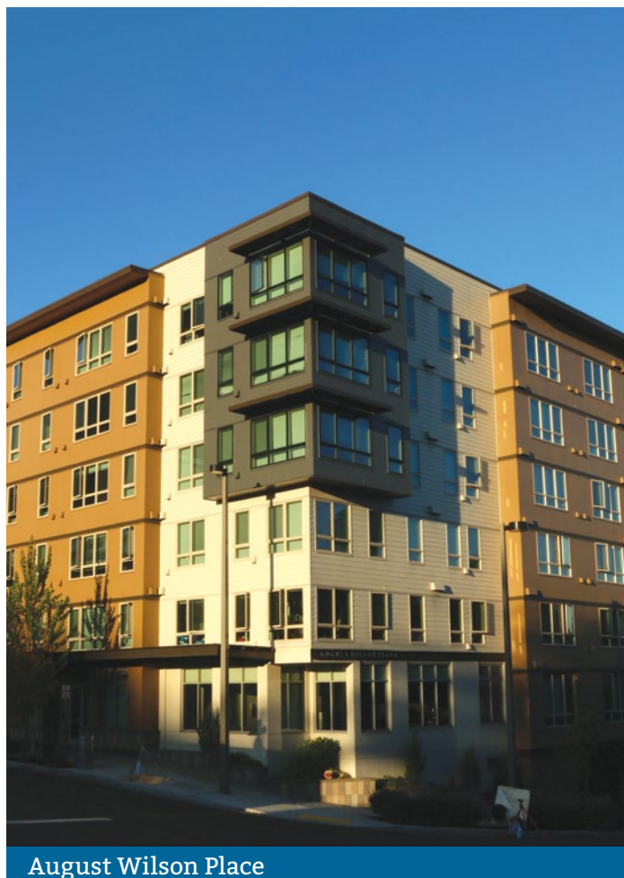
August Wilson Place

The council is expected to adopt a budget within weeks of the final budget public hearing on Nov. 12. Find details about the proposed budget, including an interactive budget book, at BellevueWA.gov/25-26-budget . Bellevue is in a stable and positive financial position, while remaining cautious and prudent, as is consistent with our long-standing policies and practices.