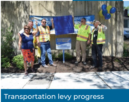
Transportation levy progress