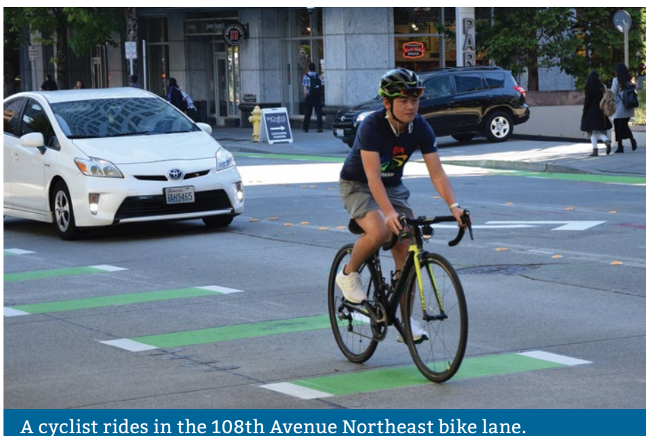
A cyclist rides in the 108th Avenue Northeast bike lane.