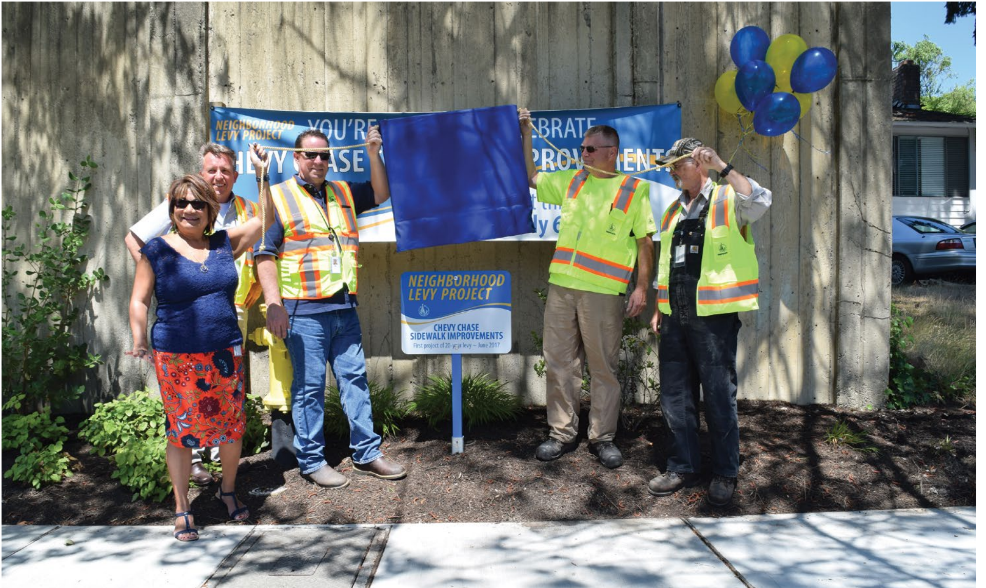
In June 2017, the first levy project kicked off, with 360 sidewalk panels repaired in the Crossroads neighborhood.