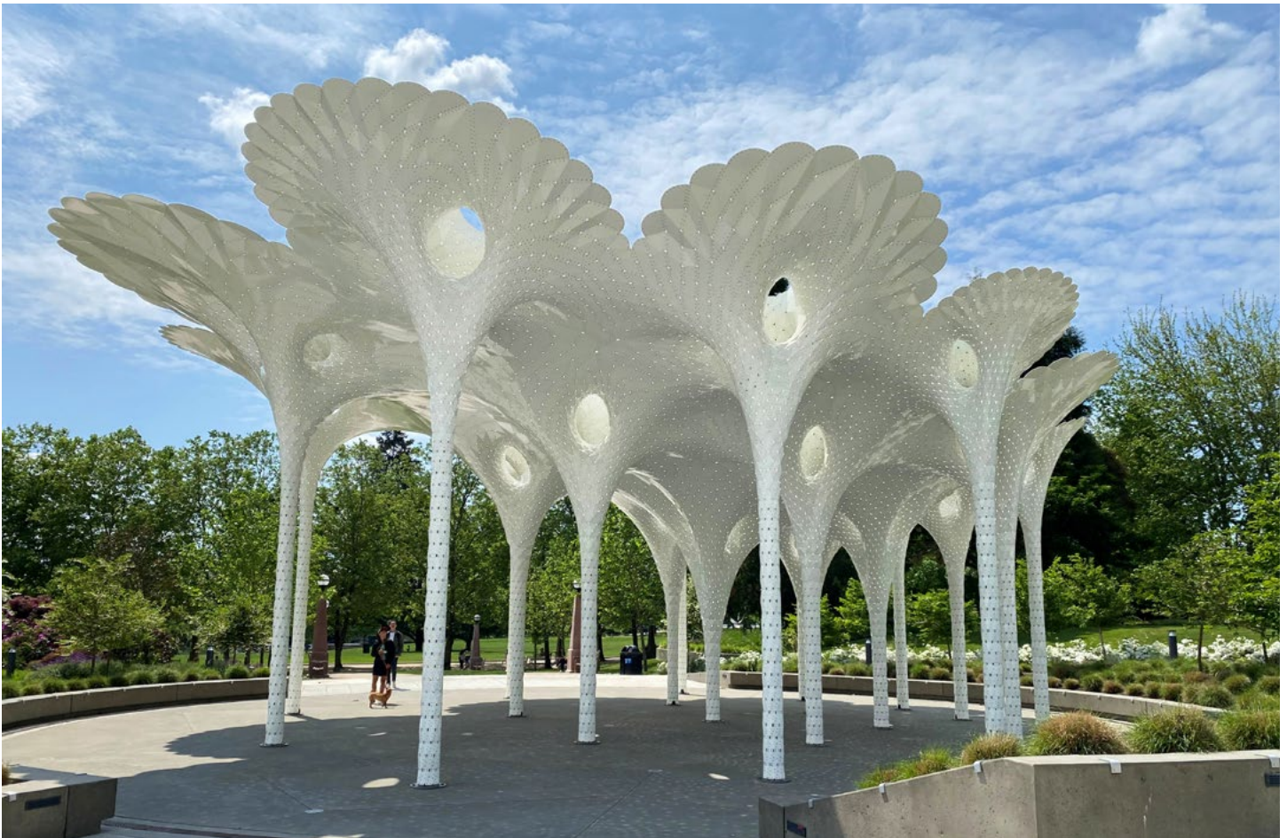
Piloti ©2023 MARC FORNES / THEVERYMANY. All Rights Reserved