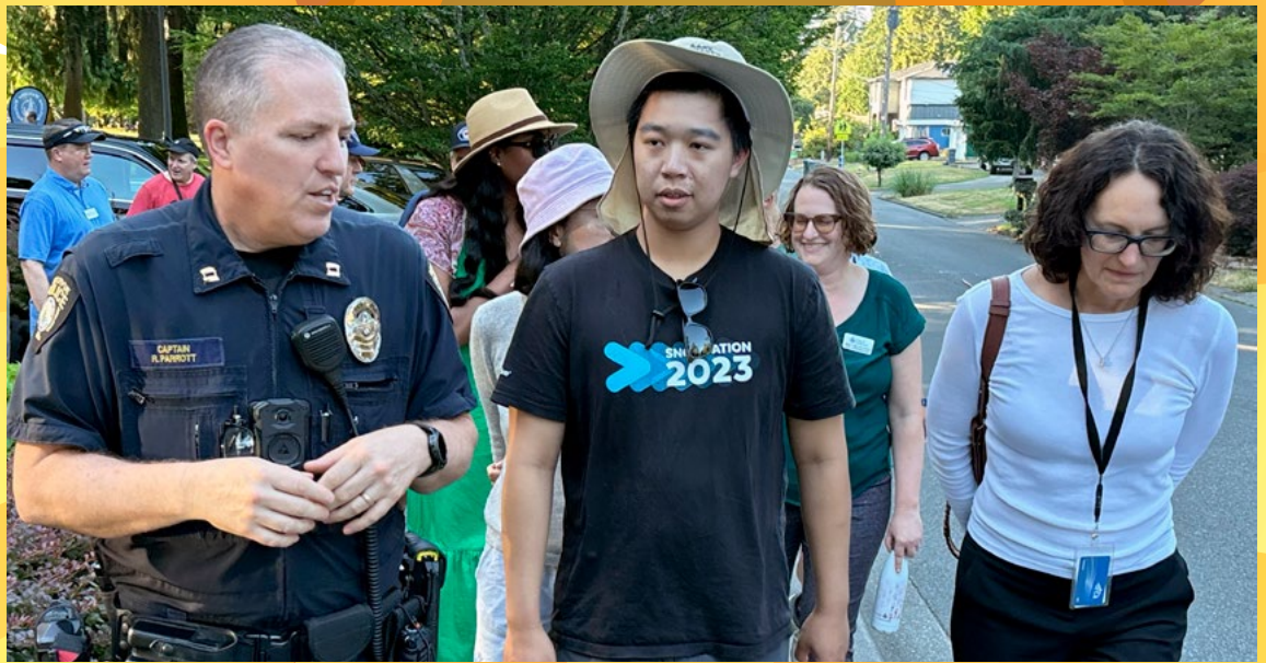
Lake Hills/ West Lake Sammammish