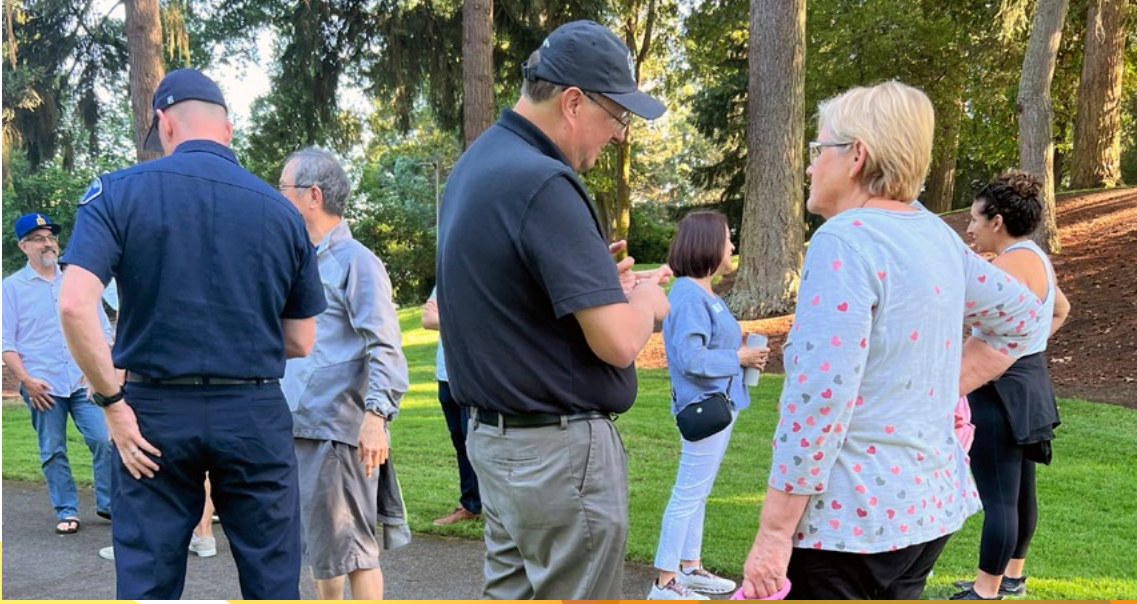
Lake Hills/ West Lake Sammammish

Thank you for coming out to visit and walk with city staff and leaders and your neighbors during this year's Neighborhood Walks in West Lake Samm/Lake Hills, Factoria and West Bellevue!