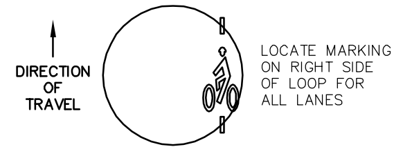
ROUND LOOP (ALWAYS RIGHT SIDE)