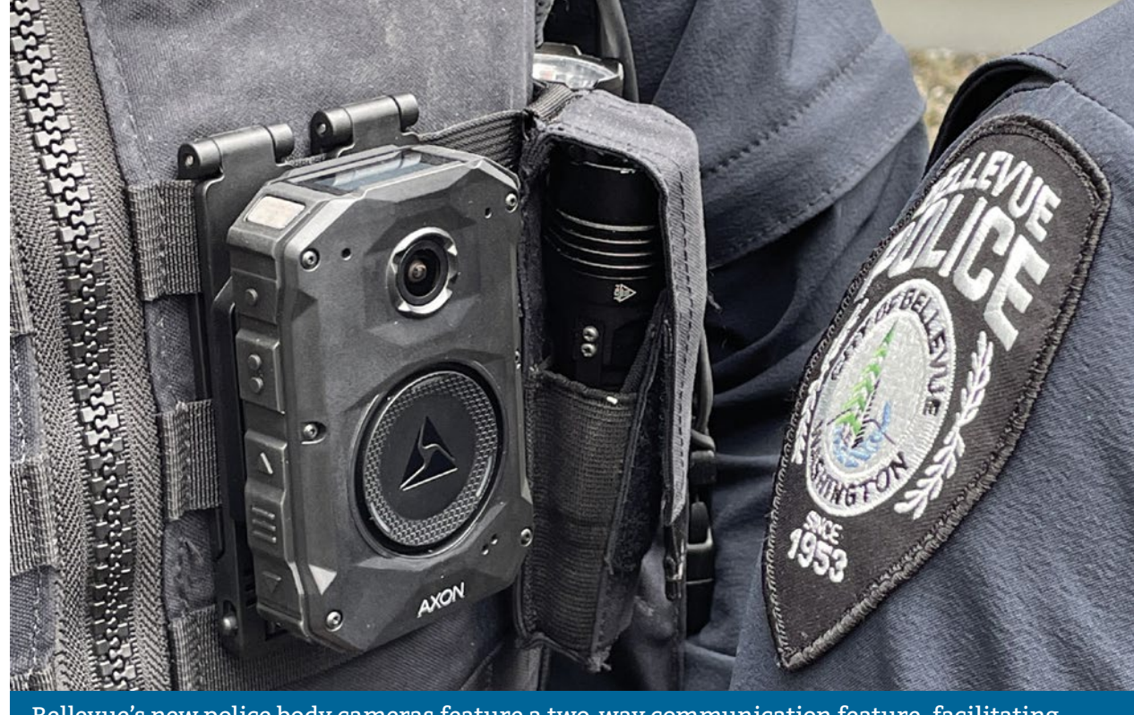
Bellevue's new police body cameras feature a two-way communication feature, facilitating audio and video interactions between officers and command centers.

The acquisition of body cameras is the culmination of years of preparation. The department engaged the community and its police advisory councils in 2021. In 2020 an agency reviewing the department's use-of-force policies recommended the use of body cameras.