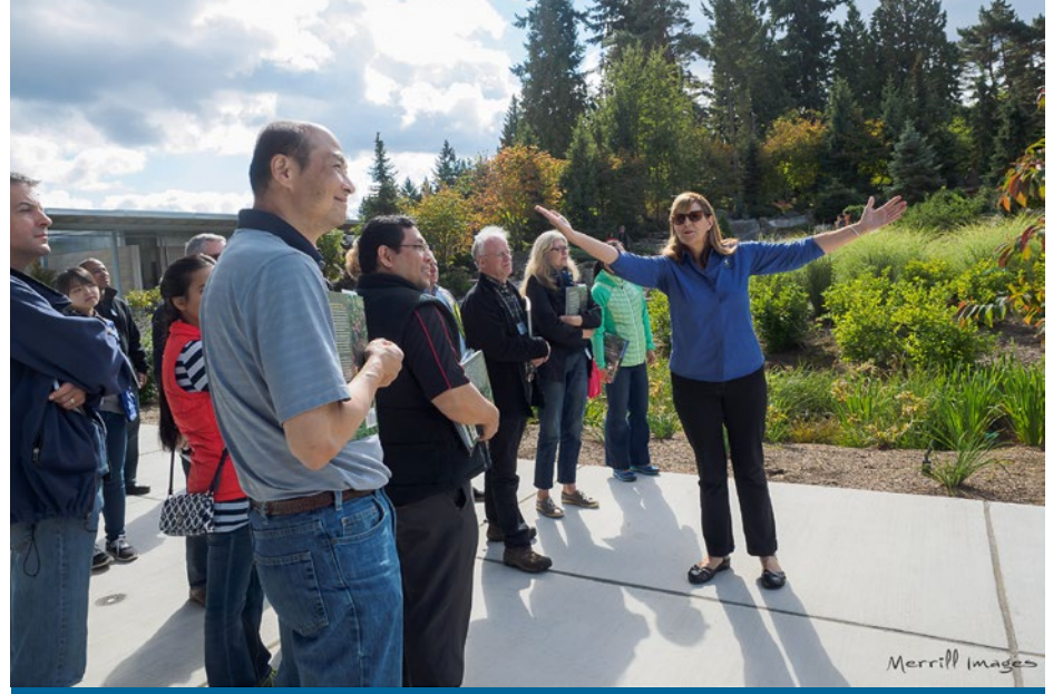
Experience Bellevue will feature tours of city facilities such as the Bellevue Botanical Garden pictured here.