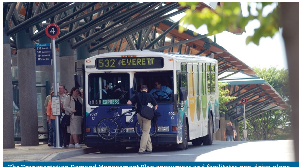
The Transportation Demand Management Plan encourages and facilitates non-drive-alone commuting options like the bus and/or bike.

The city maintains a website at ChooseYourWayBellevue.org and a Choose Your Way Bellevue app, both of which support the TDM program with information about sustainable transportation options for and services to support Bellevue travelers.