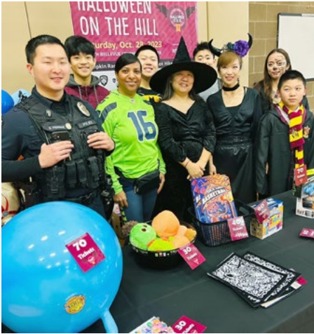
Halloween on the Hill