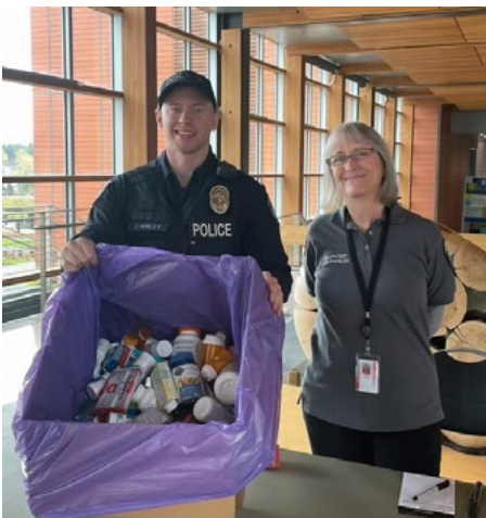
Drug Take Back