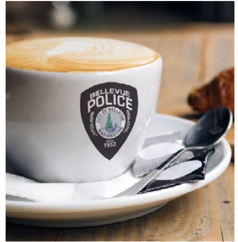
Coffee with a Cop