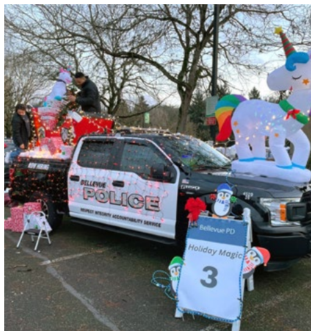
Battle of the Badges