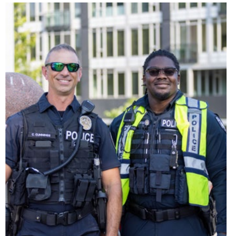
Bellevue Family 4th