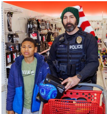
Shop with a Cop