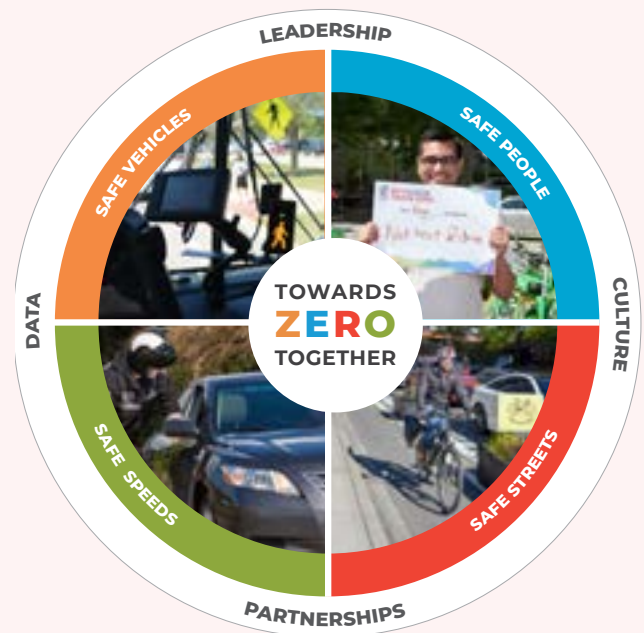
Figure 2: The Bellevue Safe System approach rests on four pillars (Safe Speeds, Safe People, Safe Vehicles and Safe Streets) paired with four supportive elements (Data, Leadership, Partnerships and Culture).

In its advisory role in the development of the city's Strategic Plan, the Bellevue Transportation Commission examined the attributes of the Safe System approach and concurred that Safe People, Safe Streets, Safe Speeds, Safe Vehicles—as well as the supporting elements of Leadership, Culture, Partnerships and Data—all help contribute to reducing the frequency and severity of crashes (see Figure 2). This holistic approach accepts that people will make mistakes and that crashes will continue to occur, but it aims to ensure these do not result in serious injuries or fatalities.