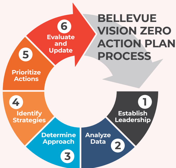
Figure 1: Process to develop Bellevue's Vision Zero Strategic Plan and annual Action Plans.

The City of Bellevue is using a six-step process to develop, implement, monitor and refine its Vision Zero strategy (see Figure 1).