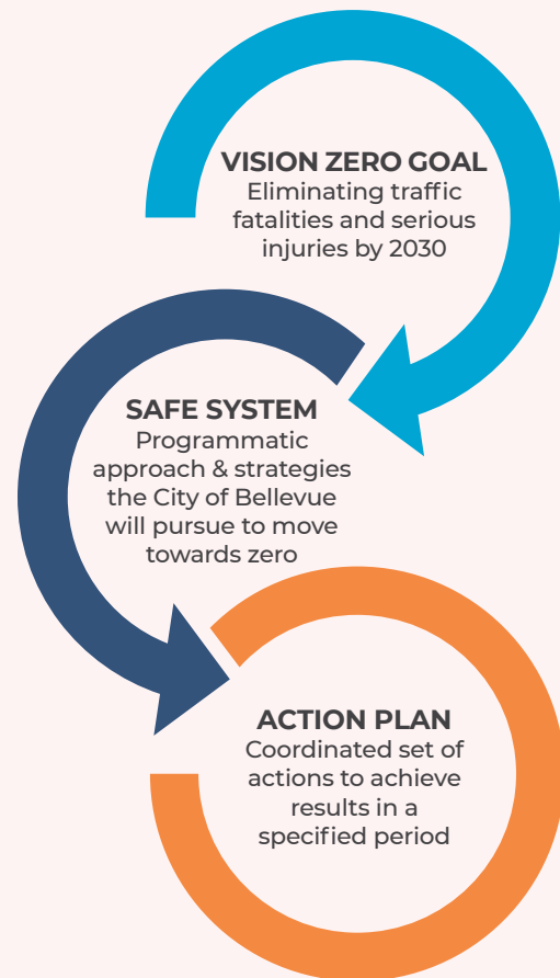
Figure 4: Annual Action Plans build on the Safe System approach and Strategic Plan—a yearly recommitment to address systemic traffic safety challenges holistically through interdepartmental “One City” collaboration.

In this context the Steering Team is working to find the best solution that delivers measurable improvement, is affordable and can be implemented in a reasonable time frame (see Figure 4). Annual Action Plans are living documents, to be continually updated as new data becomes available and as new Safe System actions prove to be successful in making Bellevue streets safer.