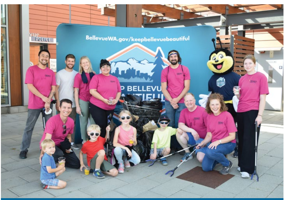
A team of volunteers from FREIHEIT Architecture participated in the downtown cleanup on Aug. 12.