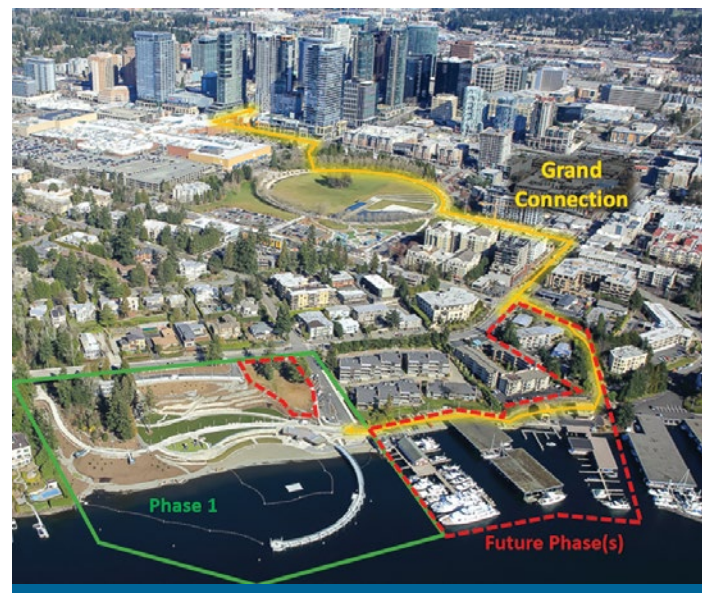
The map indicates which parts of the park will be improved for the second phase.

Expanding the park's connection to downtown, one of the objectives of the 2010 park master plan will be the focus of a second phase of the project starting now. With landscape architect Berger Partnership, the city will come up with designs later this year and in early 2024.