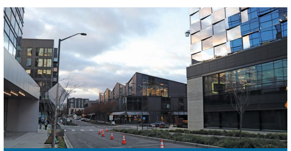
The city is studying ways to accommodate anticipated growth in housing and jobs in Bellevue over the next 20 years, with new apartment buildings and office buildings coming to BelRed.

Public input is an important part of each step in the process and community members are encouraged to get involved. Residents can consult BellevueWA.gov/comprehensive-plan or the interactive EngagingBellevue.com/bellevue-2044 . They can also subscribe for email or text Alerts about updates in the process.