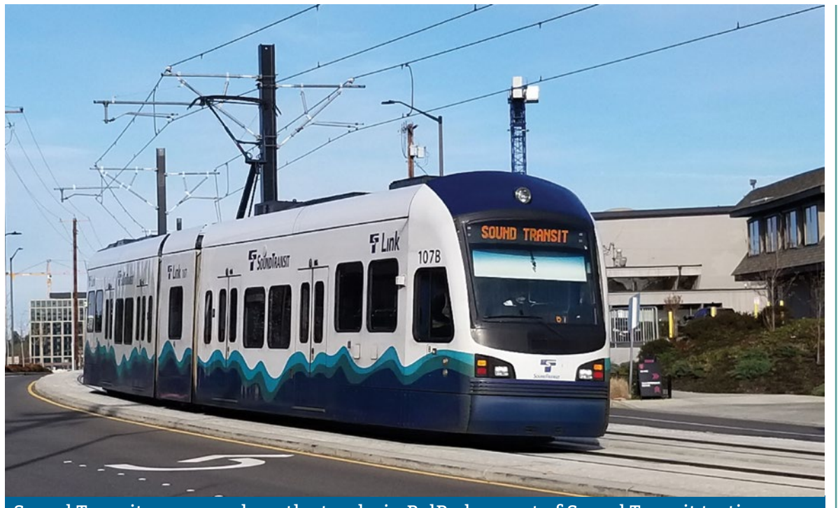
Sound Transit cars run along the tracks in BelRed as part of Sound Transit testing.