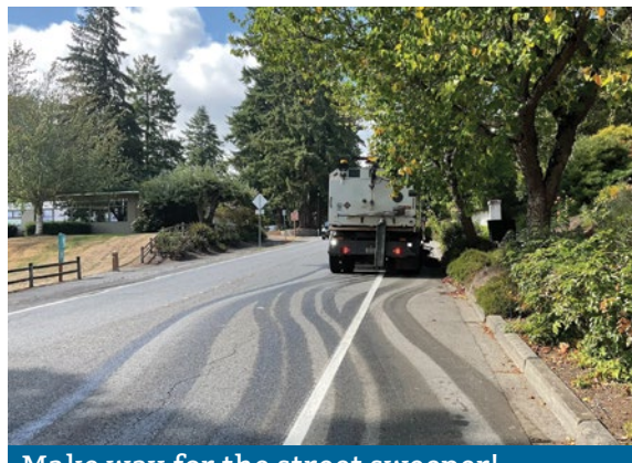
Make way for the street sweeper!