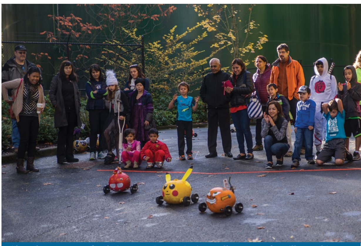
Kids and parents root for their respective entries in a Halloween on the Hill pumpkin race.

Pumpkin racer supplies kit ($25) required unless you already have supplies.