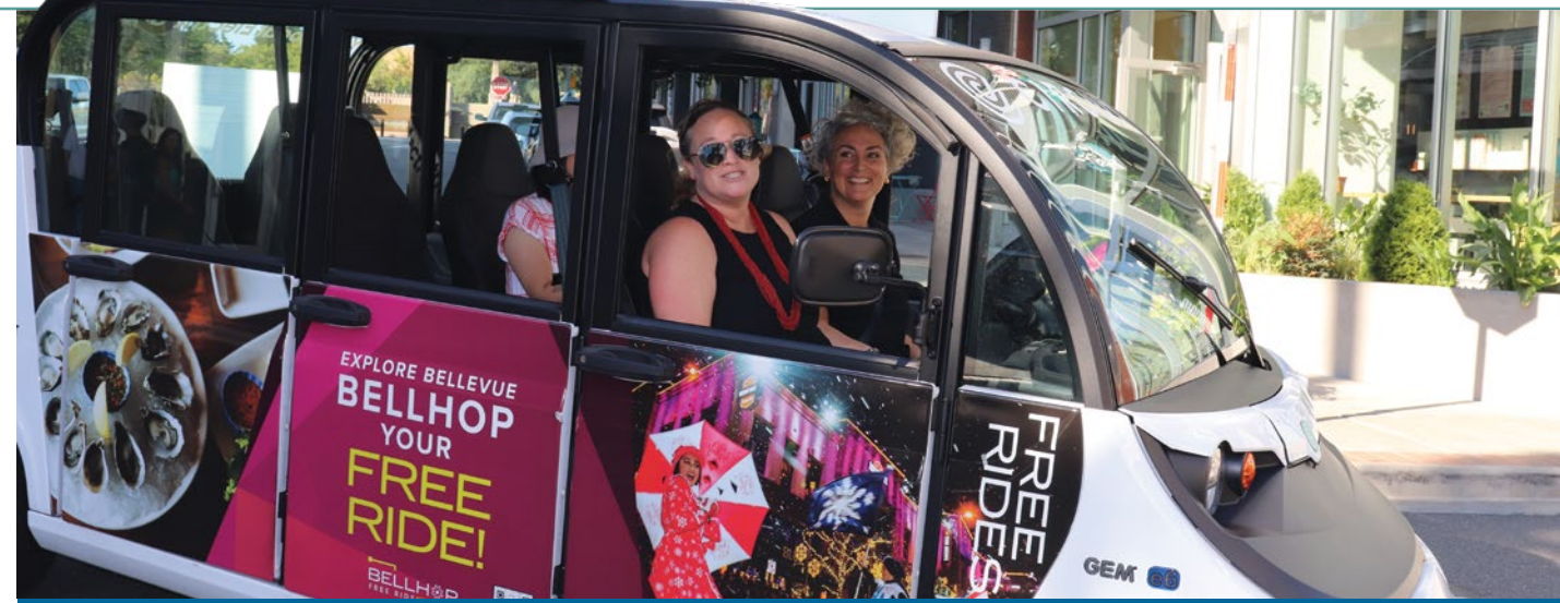
The colorful Bellhop shuttles can zip up to five riders around downtown and parts of Wilburton and BelRed.