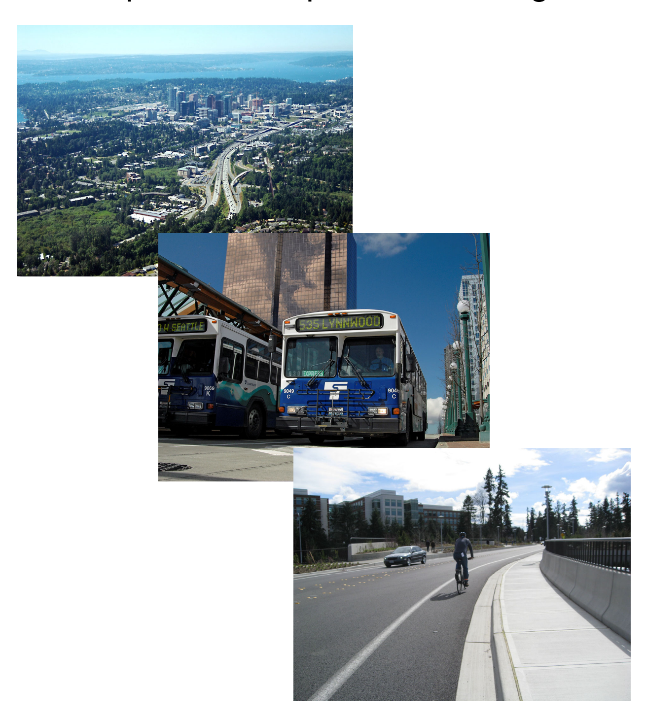
June 5, 2023—Resolution 10258