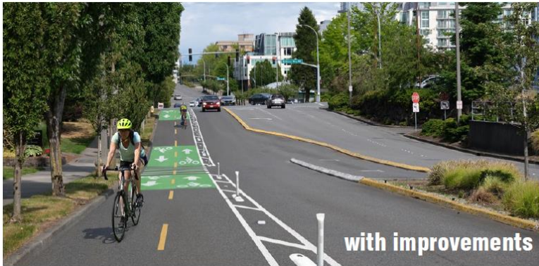
NE 12th Street west of Bellevue Way