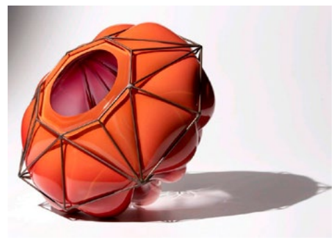
"Carnelian Crystal" by KT Hancock, blown glass and stainless steel