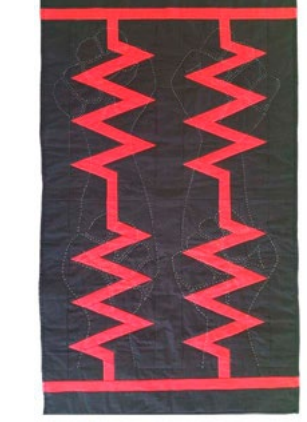
"Autumn Falls 8" by Akiko Sogabe, paper cutting

The collection of new artworks will be on display on the City Hall Lobby Mezzanine in