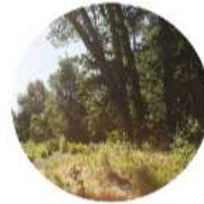
● Natural Areas