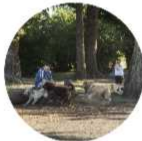
● Dog Park