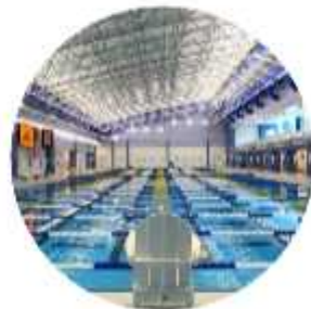
● Aquatic Center