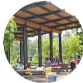
● Picnic Areas