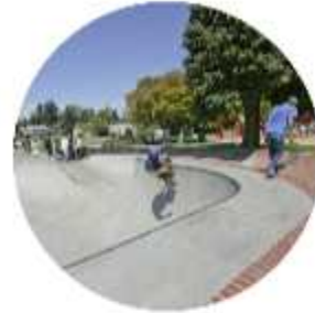
● Skate Park