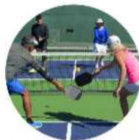
● Sports Courts