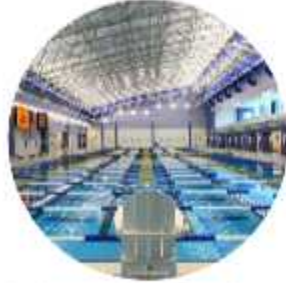
● Aquatic Center