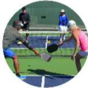
● Sports Courts