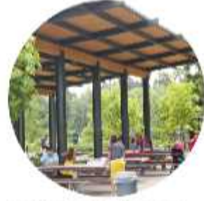
● Picnic Areas