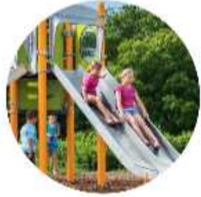
● Playground/Water Play