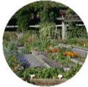
● Community Garden