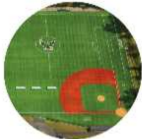
● Sports Fields