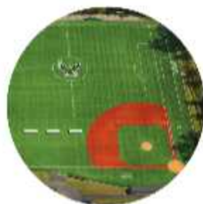
● Sports Fields