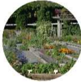
● Community Garden