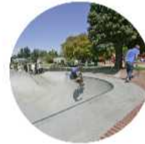
● Skate Park