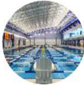
● Aquatic Center