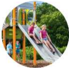
● Playground/Water Play