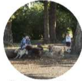
● Dog Park