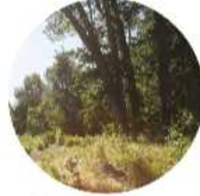
● Natural Areas