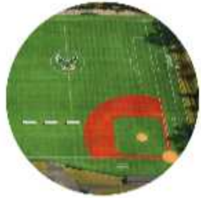
● Sports Fields