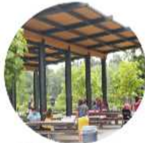
● Picnic Areas