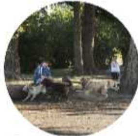
● Dog Park