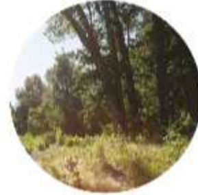
● Natural Areas