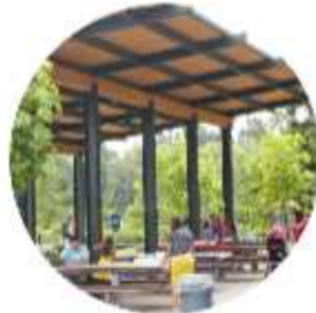
● Picnic Areas