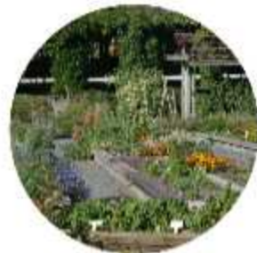
● Community Garden