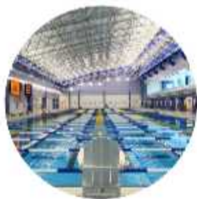
● Aquatic Center