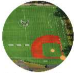
● Sports Fields