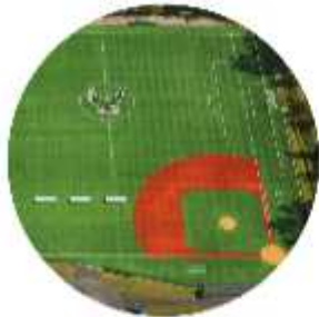
● Sports Fields