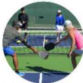
● Sports Courts