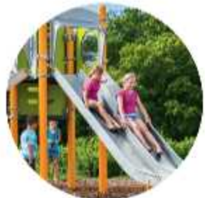
● Playground/Water Play