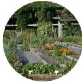
● Community Garden