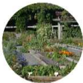
● Community Garden