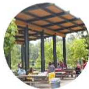
● Picnic Areas