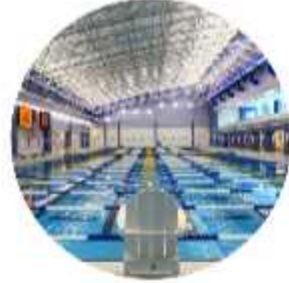
● Aquatic Center