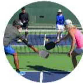
● Sports Courts