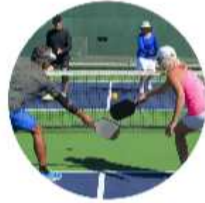
● Sports Courts