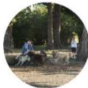
● Dog Park