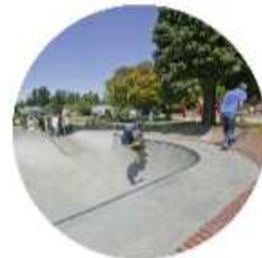
● Skate Park