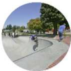
● Skate Park