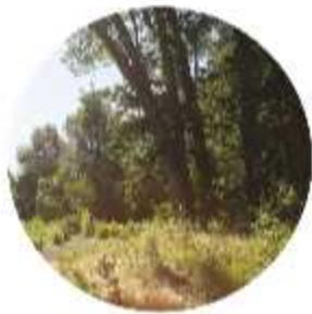
● Natural Areas