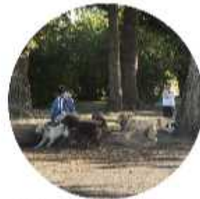
● Dog Park