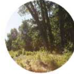
● Natural Areas