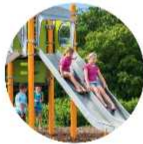
● Playground/Water Play