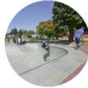
● Skate Park