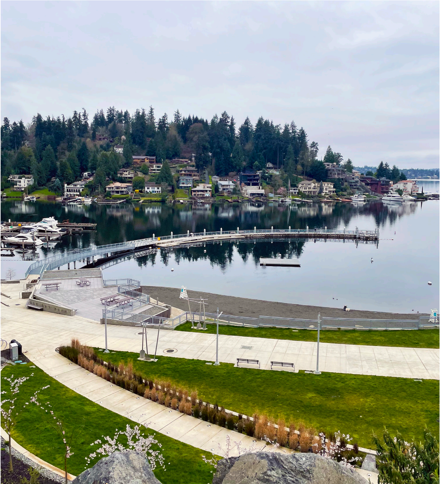
Meydenbauer Bay Park