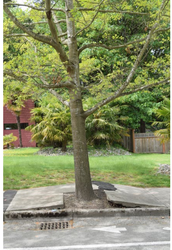
Heaved sidewalk on 112th Avenue NE is a tripping hazard