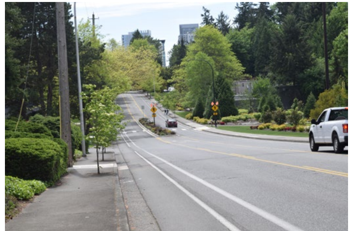
112th Avenue NE facing south towards downtown