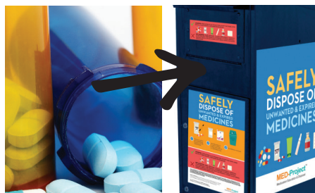
Safest disposal solution: take medicines to a secure local dropbox

You can find a list of local dropboxes and more information on types of accepted medicines at www.medproject.org .