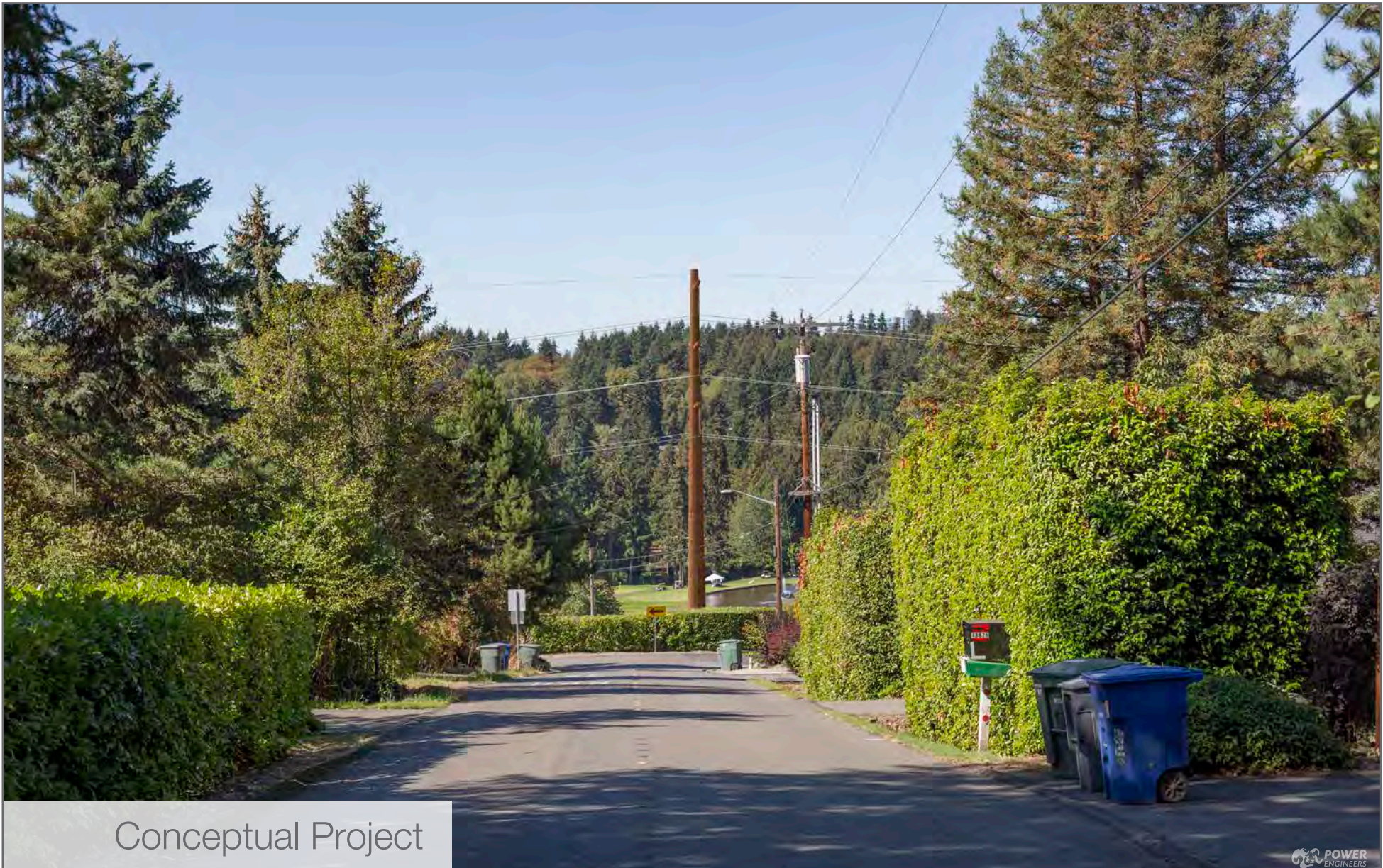
Photo simulations are for discussion purposes only and may change pending public, regulatory and utility review