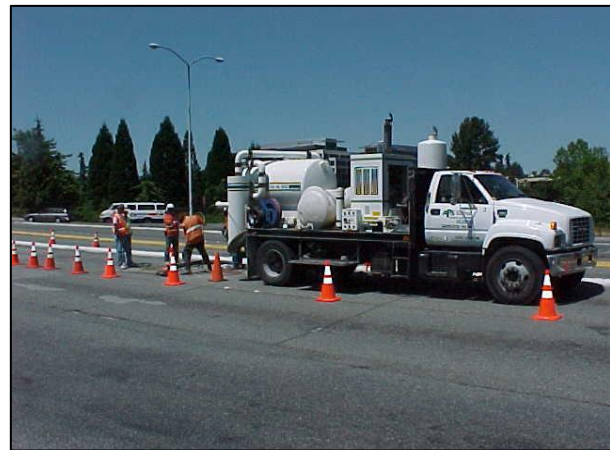
Typical vacuum truck used for locating utilities.

Starting as early as November 1, crews will use equipment to locate underground utilities along West Lake Sammamish Parkway NE and neighborhoods near 177th Ave NE, 180th Ave NE, NE 34th St, NE 21st St, and NE 24th St. Crews will dig a small hole at each location to reach the underground utility. Each location will then be restored with grass, pavement, or gravel when work is complete.