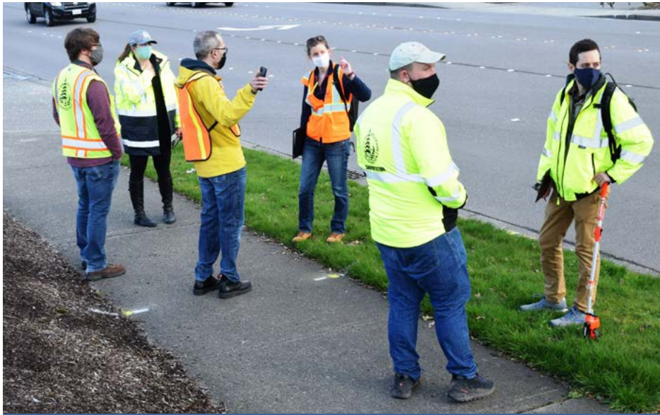
Bellevue Transportation staff lead a road safety assessment on Northeast Eighth Street, near Crossroads Bellevue mall, part of the city's Vision Zero work.

Work was completed on a strategic plan, and the City Council voted to fund Vision Zero projects in the city's 2021-2027 capital budget.