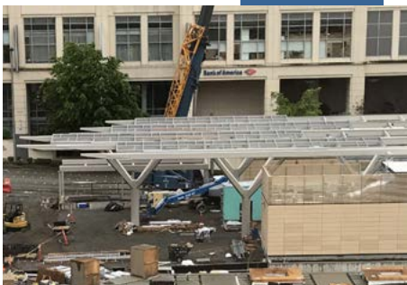
East Link milestone