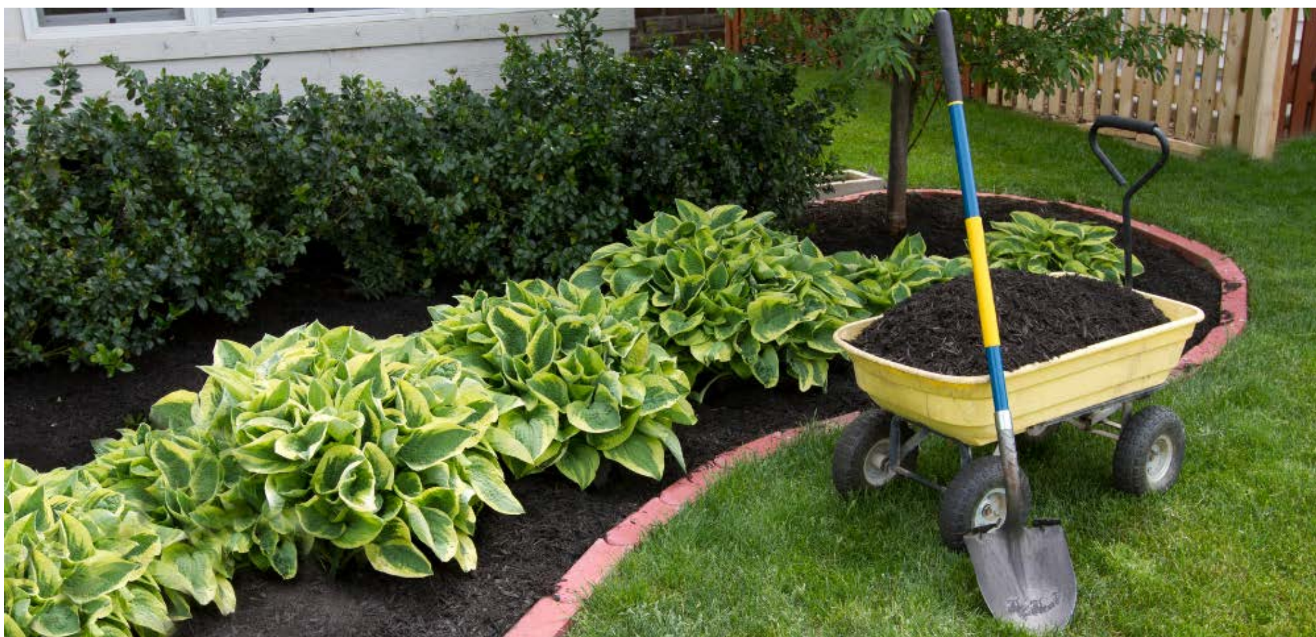
Adding mulch to garden beds will help keep moisture in and weeds out.

Preparing for summer painting projects? Before you toss or keep storing your old paint, take cans to a local paint store participating in the Washington PaintCare program to recycle it for you. You can find local paint and hardware stores that accept paint, stains and other finishes at PaintCare.org/states/washington .