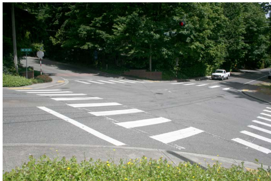
Continental crosswalk to be implemented at signalized intersections.