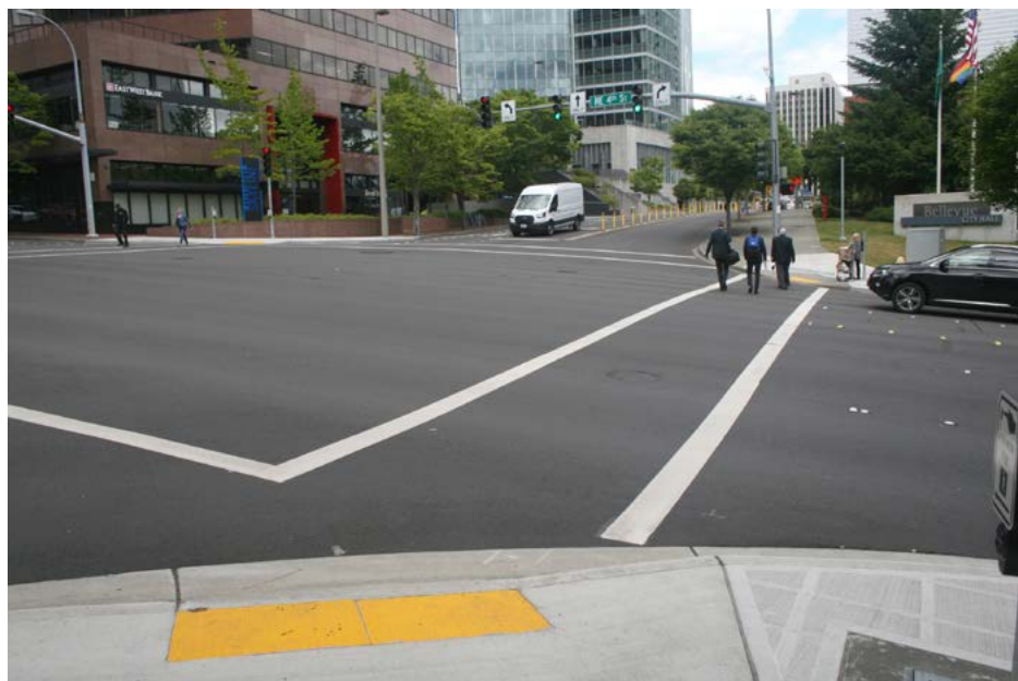
Traverse (parallel bar) crosswalk presently seen in Bellevue.

The new crosswalk pavement markings will be phased in over time as new development takes place, roadways are repaved and through other, smaller projects.