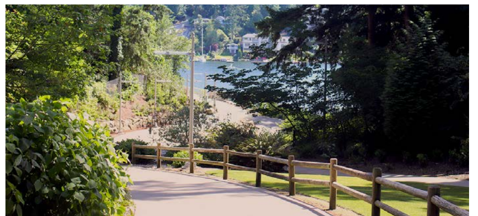
The Meydenbauer Bay Park is a gem in the Northwest Bellevue neighborhood area.

The neighborhood plans are built around core values identified in the early visioning stage, which consist of five key elements: