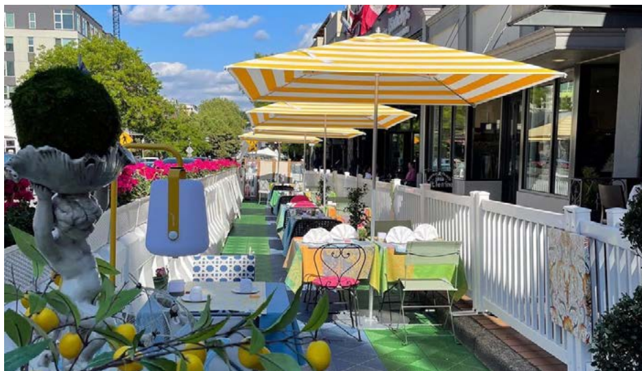
The Bis on Main restaurant has established "patio" dining in parking stalls along Main Street.

With summer here, the city is supporting Bellevue restaurants offering outdoor dining on streets, sidewalks, private patios and even parking lots. In addition to Main Street eateries that started offering on-street dining last year, over 40 other restaurants across the city are giving diners an al fresco option.