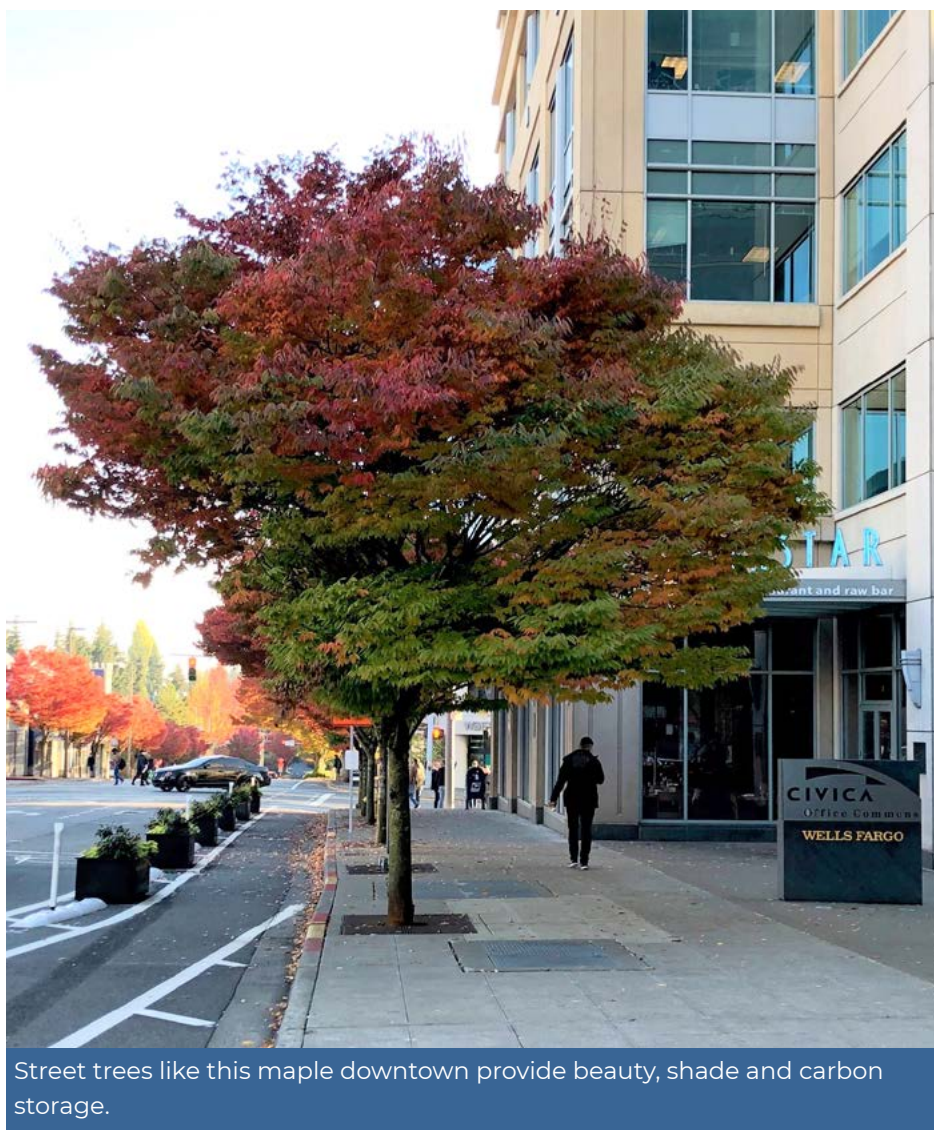
Street trees like this maple downtown provide beauty, shade and carbon storage.

Trees provide benefits to the community such as carbon storage, cleaner air and water, improved childhood development and better