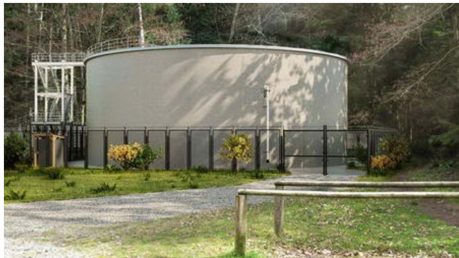
The new reservoir, shown in this visualization, will be made of concrete instead of steel.

This project is part of Bellevue Utilities' Reservoir Rehabilitation or Replacement program.