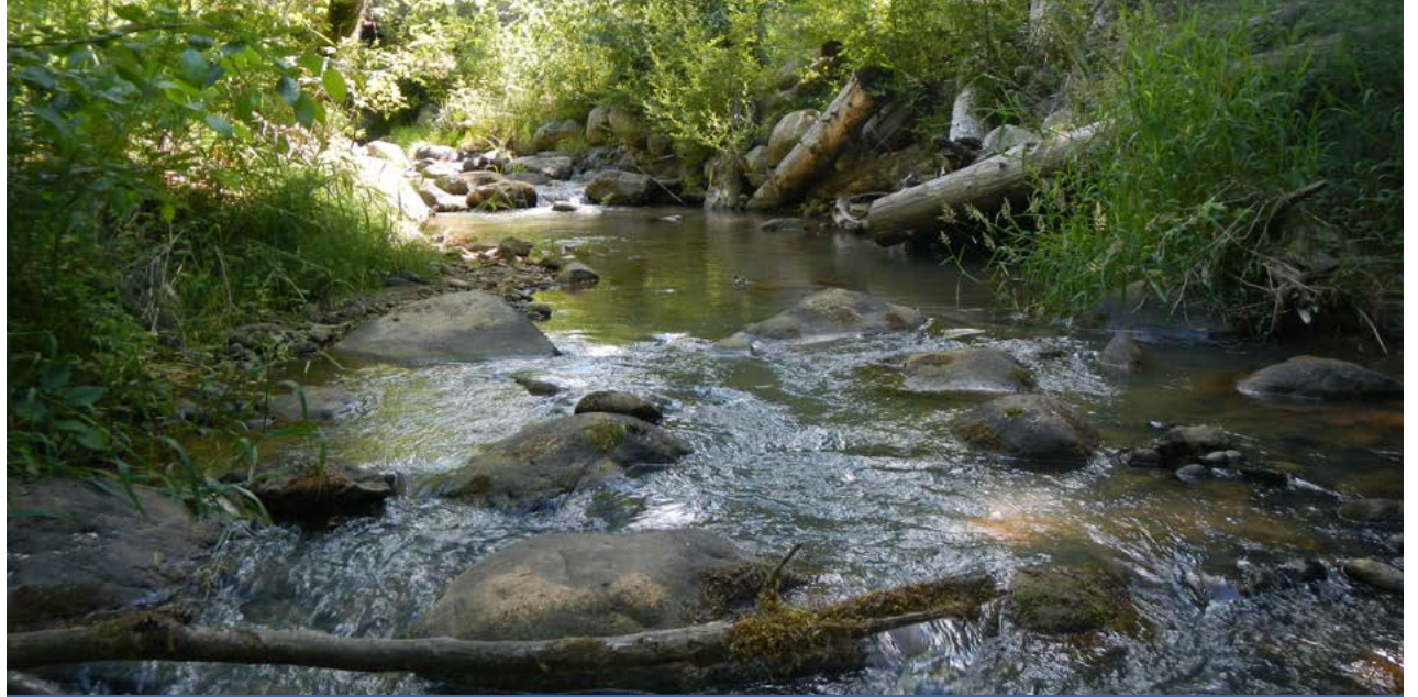
The watershed management plan will help preserve healthy streams such as Coal Creek, which underwent recent restoration.

What happens in our watersheds impacts the water quality and habitat of Lake Sammamish and Lake Washington, and ultimately, Puget Sound.