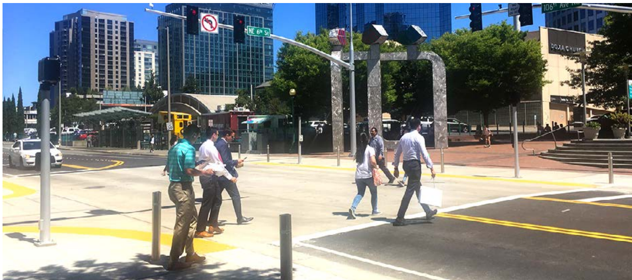
The idea behind the Mobility Implementation Plan is to consider all users of Bellevue’s transportation system, including walkers such as these crossing 106th Avenue Northeast.