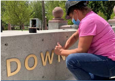
New gateway at Downtown Park