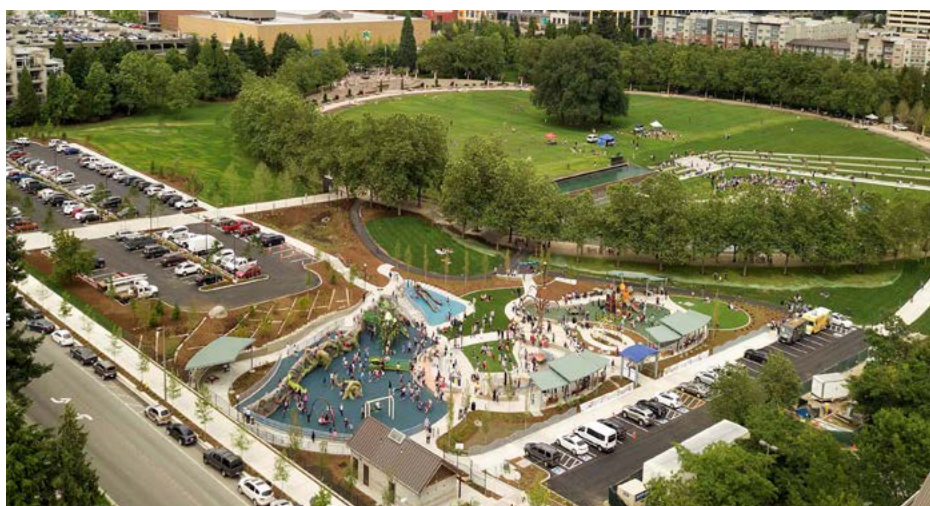
The immensely popular and accessible Inspiration Playground at Downtown Park is a shining example of Bellevue's efforts to add equity.

"Bellevue came together to become a more just and equitable community," the National Civic League said in a statement. "Bellevue's development of an accessible playground for children of all abilities, commitment to cultural competency and ability to meet residents' needs during the pandemic are just a few of the reasons it is an All-America City."