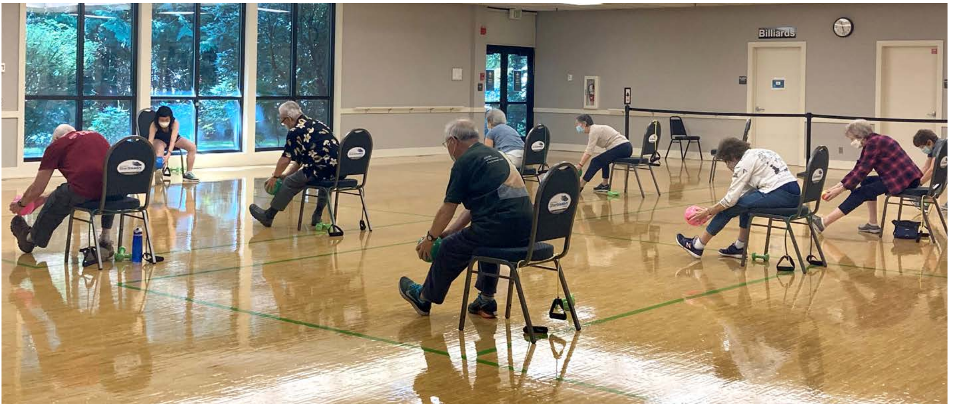
A group participates in the North Bellevue Community Center's Silver Sneakers exercise class.