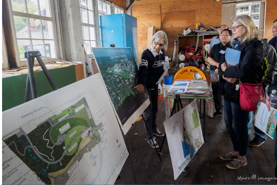
A previous Bellevue Essentials class learns about the development of the Meydenbauer Bay Park.

After a successful, fully virtual 2020 program, Bellevue Essentials is expected to transition to a hybrid format this year, with a combination of in-person and online learning. Participants will