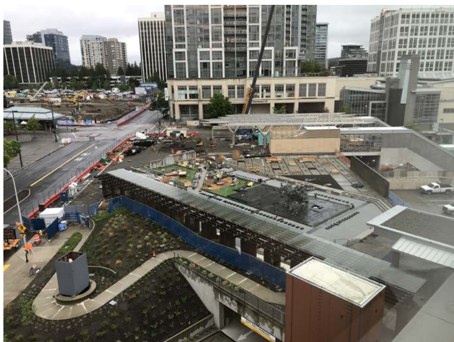
The City Hall plaza next to the Bellevue Downtown station has been redesigned, with public art removed during construction, including “The Root,” being reinstalled.

The end is in sight for construction of Sound Transit’s East Link light rail line, a project that has changed Bellevue’s skyline and will change its travel options even more. The aerial guideway, at-grade tracks, downtown tunnel, retaining and sound walls, and stations are 95% complete.