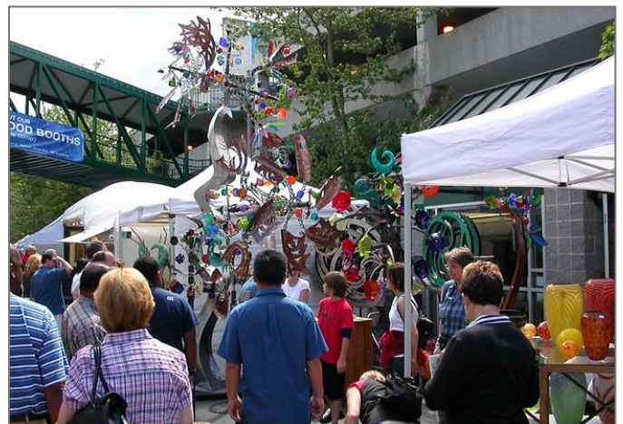
Bellevue Arts Fair

Visit the City's "Projects in Your Neighborhood" map: https://bellevuewa.gov/city-government/departments/utilities/utilities-projects-plans-standards/projects-in-your-neighborhood