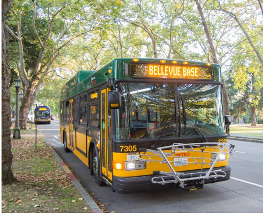
King County Metro Bus