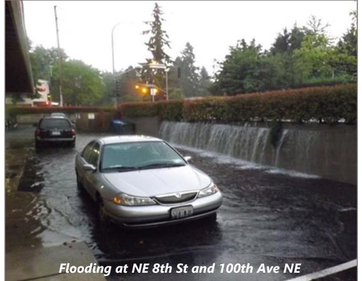
Flooding at NE 8th St and 100th Ave NE

During extreme storms, there can be significant flooding in the vicinity of NE 8th St and 100th Ave NE, which impacts people who live, work, and shop in the area. The Meydenbauer Flood Control Project will address this recurrent street flooding by constructing a bypass pipeline to better carry stormwater during heavy rains. The project will also optimize the capacity of the existing storm drain system on 100th Ave NE between NE 8th St and NE 12th St.