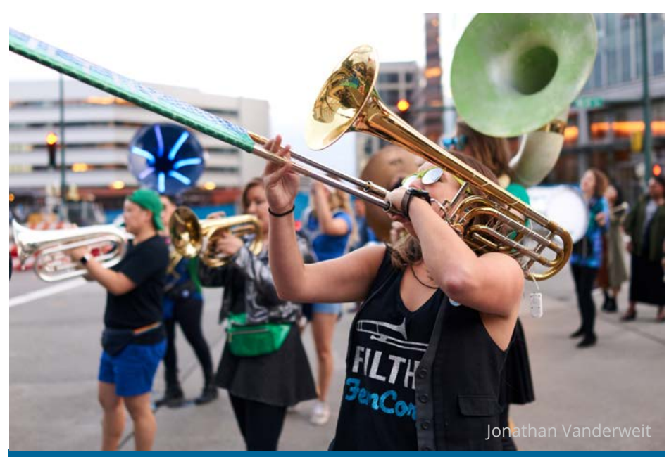
Filthy FemCorps marches to Meydenbauer Center.