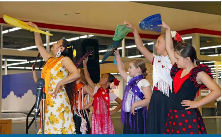
They dance flamenco at the "Bellevue Welcomes the World" event.

The vision of Welcoming Week is to unite new immigrants and long-time residents to build healthier, thriving communities. Driven and supported in partnership with Eastside Refugee and Immigrant Affairs, all events and programs support were open and free to the public.