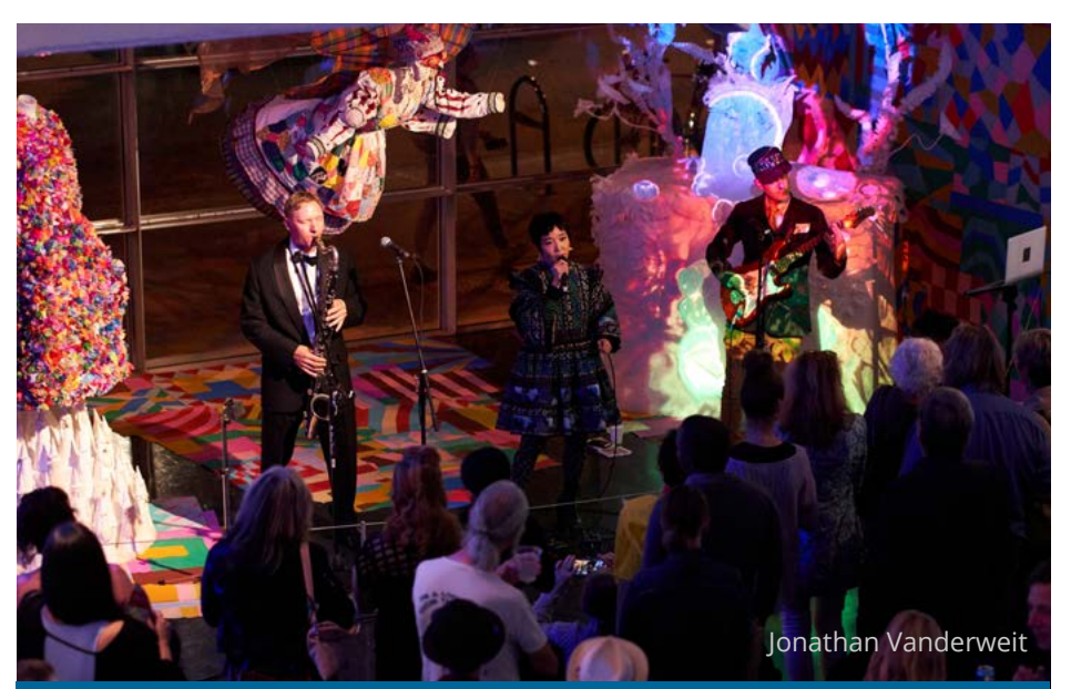
The Degenerate Art Ensemble performs at the Bellevue Arts Museum

From 1992 to 2016, the city hosted a biennial sculpture exhibition, which evolved as a catalyst for Bellevue's growing art scene and the Grand Connection pedestrian corridor downtown. The event became an annual arts festival last year, encompassing a wide range of arts and culture. A survey about this year's Bellwether can be taken at BellwetherArtsWeek.org.