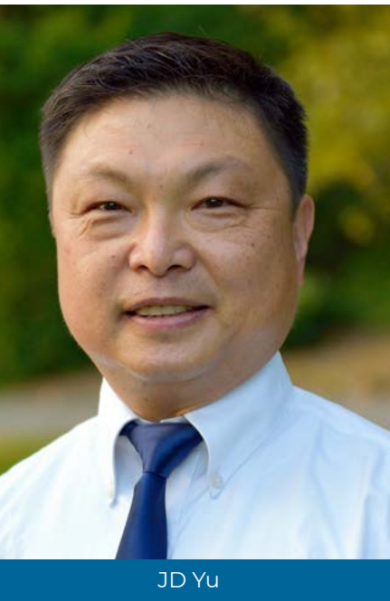
principal engineer, T-Mobile