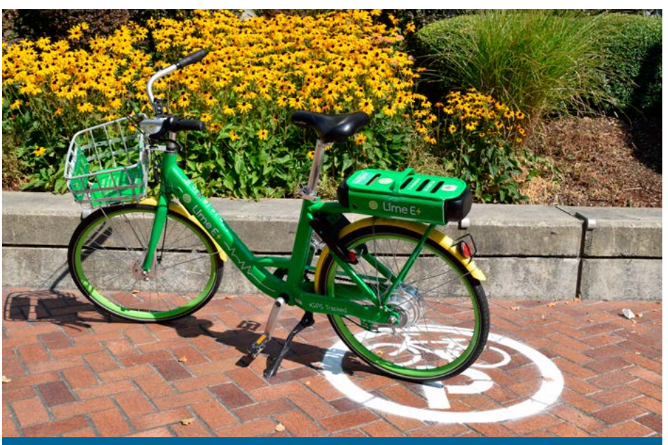
A Lime bike is parked in a designated parking area downtown.

Bellevue's bike share program is no longer new, having launched in 2018, and the city is asking for your input on how to improve the system. Here's how you can participate: