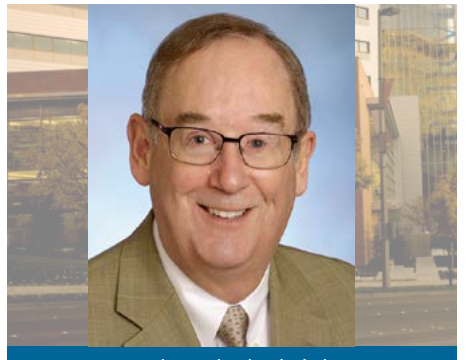
By Mayor John Chelminiak