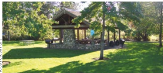
Kelsey Creek Park