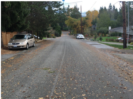
NE 20th Pl looking eastbound