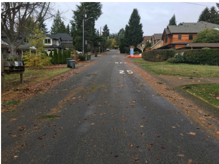
NE 20th Pl looking westbound