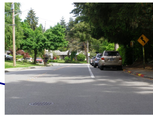
164th Ave NE facing North.