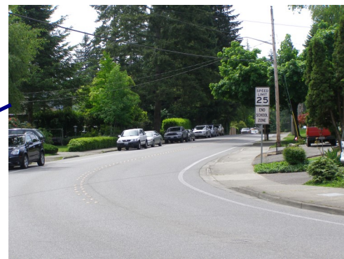
164th Ave NE facing South.