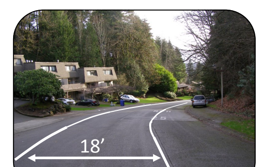
PROPOSAL FOR NE 2nd PI (FACING EAST)