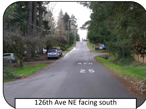
126th Ave NE facing south