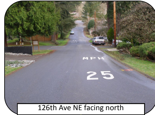
126th Ave NE facing north